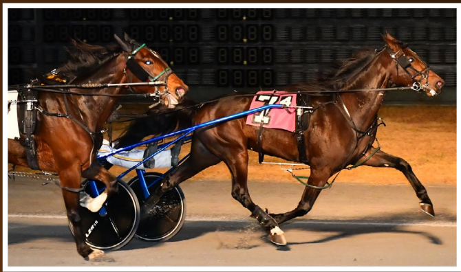
2-YR OLD TROTTING COLT & GELDING MELVIN G