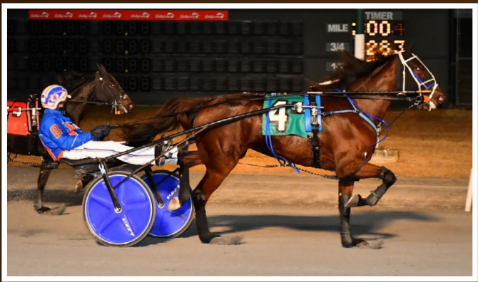
2-YR OLD TROTTING FILLY LADY BURG

CONGRATULATES THE $110,000 2-YEAR OLD FINAL WINNERS OF THE SERIES AT BALLY'S DOVER!