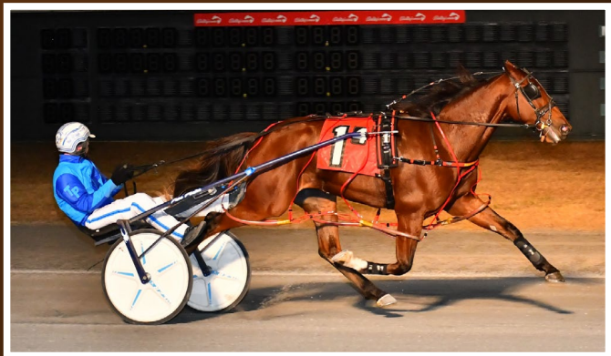
2-YR OLD PACING COLT & GELDING PRIMO MASCHIO