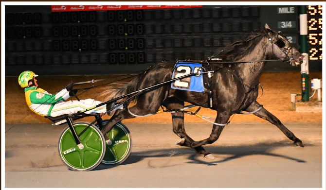
2-YR OLD PACING FILLY LITTLE MISS PEYTON