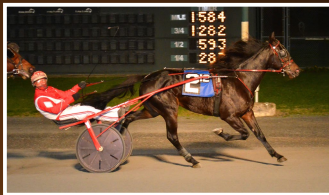
$100K DSBF 2YO COLT & GELDING TROT