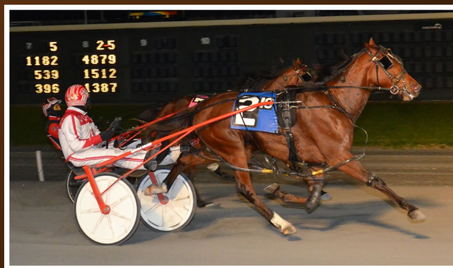
$100K DSBF 2YO COLT & GELDING PACE