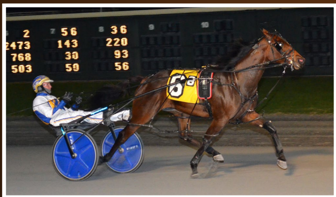
$100K RAMONA HUBBARD DSBF 2YO FILLY PACE