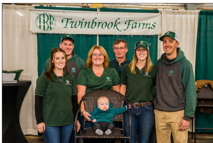
Triscari Video Web and Marketing