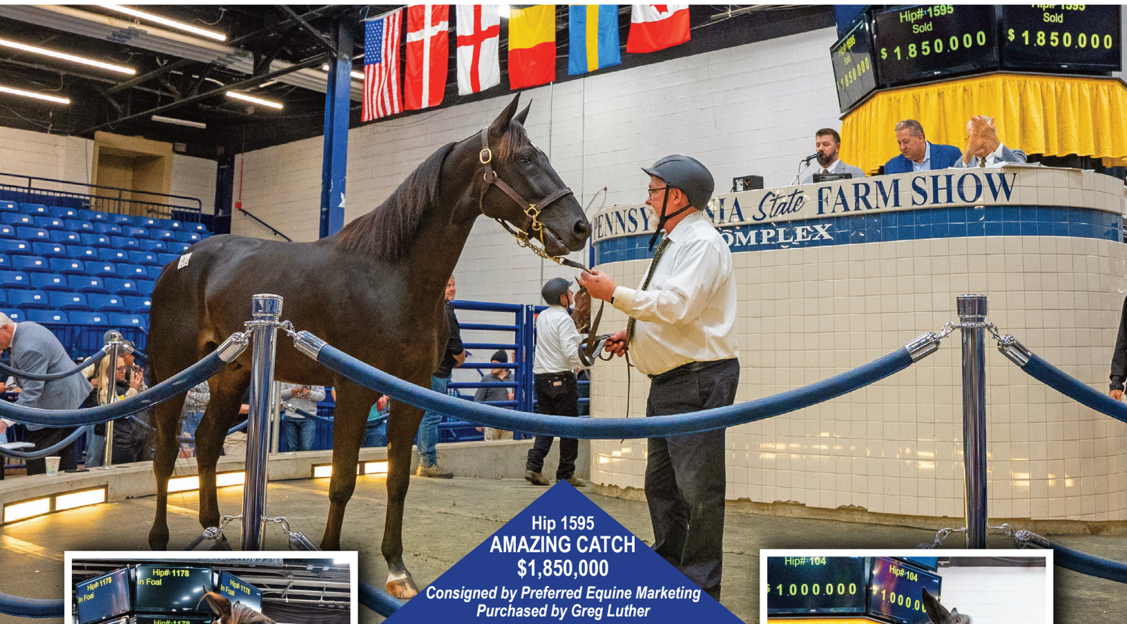
Hip 1595 AMAZING CATCH $1,850,000