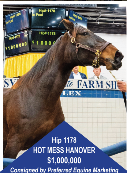
Hip 1178 HOT MESS HANOVER $1,000,000