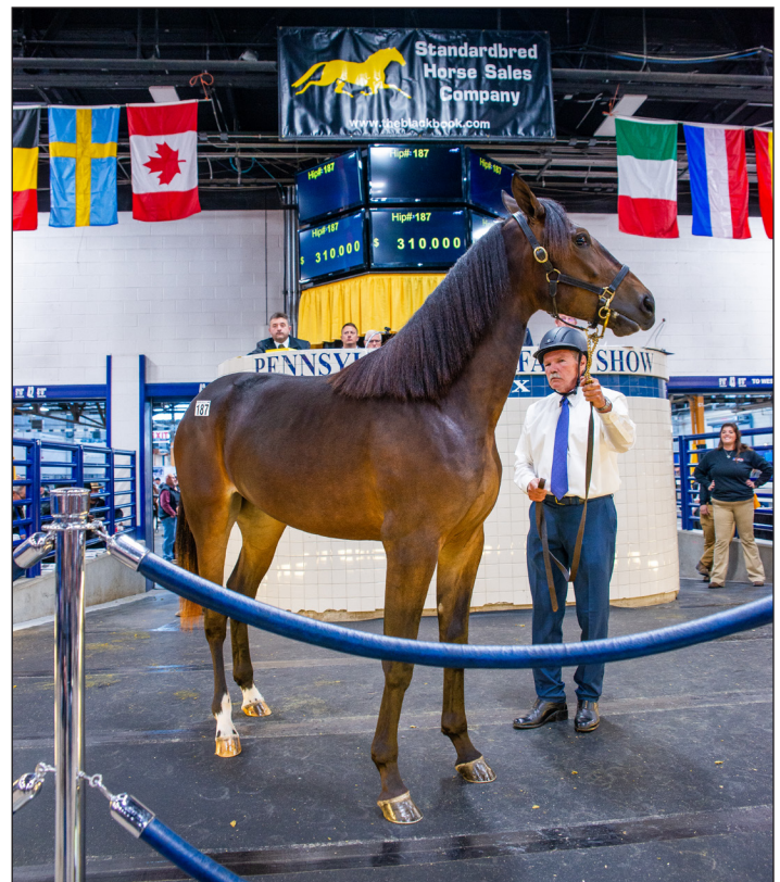
Triscari Video Web Marketing