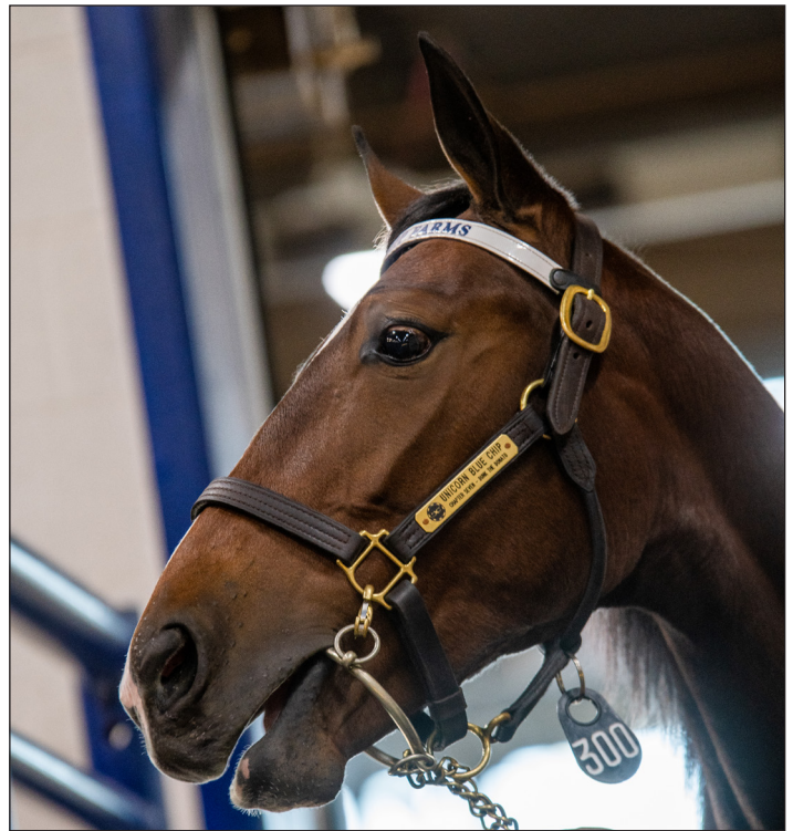
Triscari Video Web Marketing

Unicorn Blue Chip became the highest-priced yearling ever sold by Blue Chip Bloodstock in the 20 years Grossman has been selling yearlings.