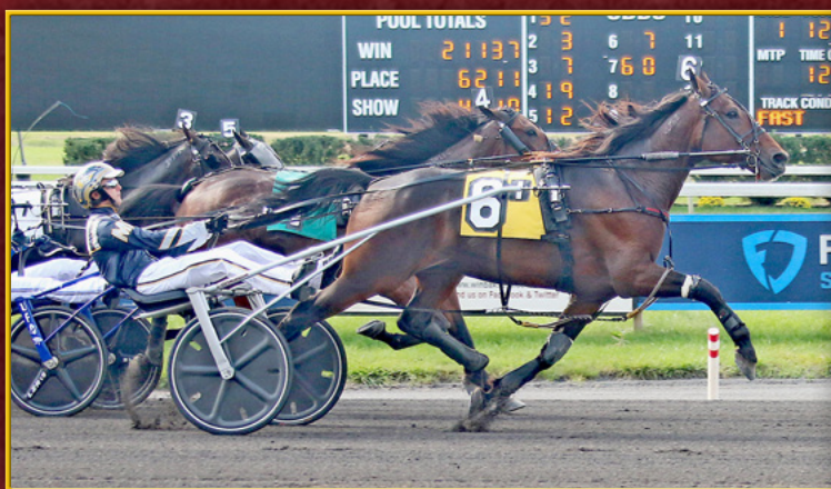
WARRAWEE ROO 1:51.2 ($784,048)

"Pedigrees That Produce Champions" From A Canadian Breeder Of The Year