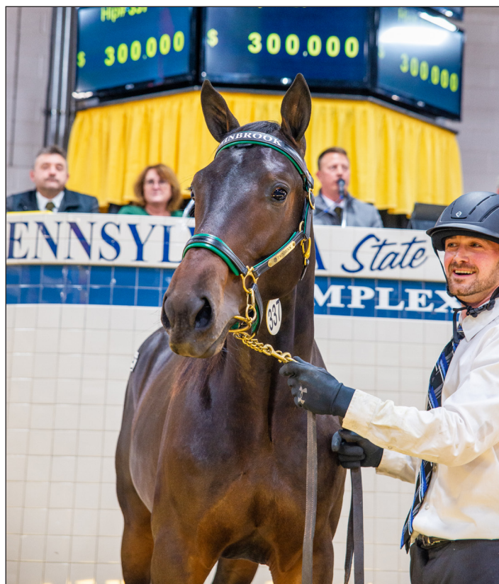
Triscari Video Web Marketing