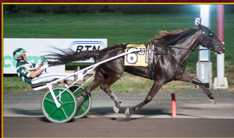
SISTER SLEDGE 3,1:51.2 ($1,100,000)

FFA standout, OSS Super Final champion and Breeders Crown Open Trot Prep winner