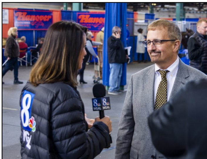
Triscari Video Web and Marketing

The second last yearling sold on Monday, hip 171 Glacier Hanover (c, Father Patrick—Global Desire) broke up the