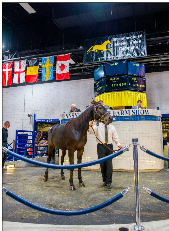
Triscari Video Web and Marketing

An outstanding opening session saw the average soar 22.3 per cent and the gross up more than $3.3 million (21 per