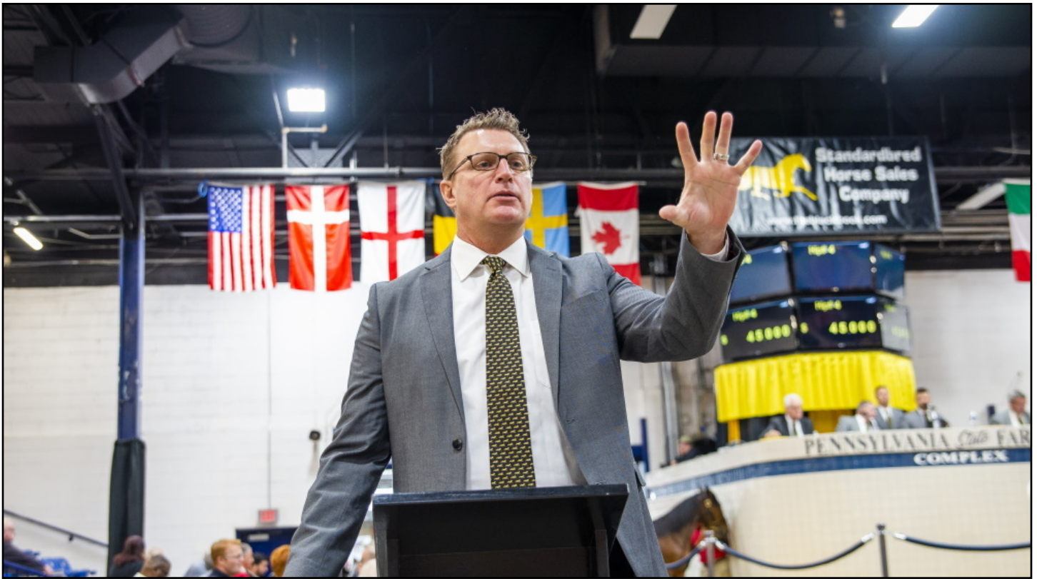
Triscari Video Web and Marketing