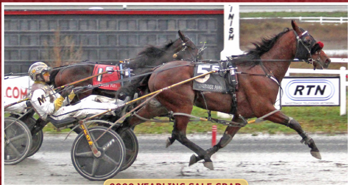
2020 YEARLING SALE GRAD

FIND THE NEXT ONES AT HARRISBURG — WHERE LINDY WILL SELL FOUR MASS/DUAL-ELIGIBLE YEARLINGS!