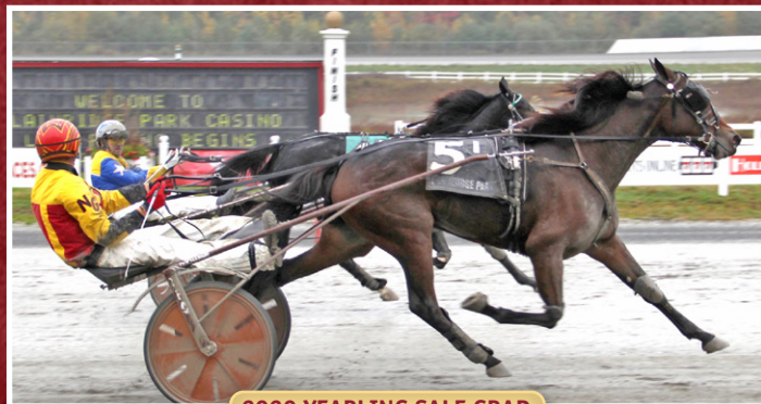
2020 YEARLING SALE GRAD