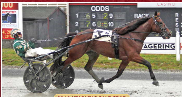
2019 YEARLING SALE GRAD