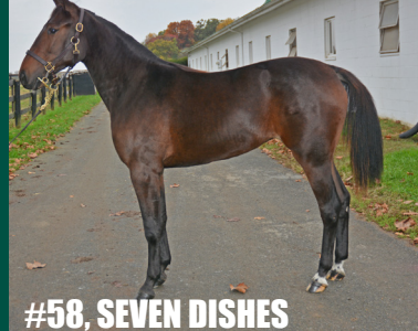
#58, SEVEN DISHES

Come See Winbak Farm's lineup at MD State Fairgrounds Sale Preview Starts Sunday. Sale Starts Tuesday at Noon!