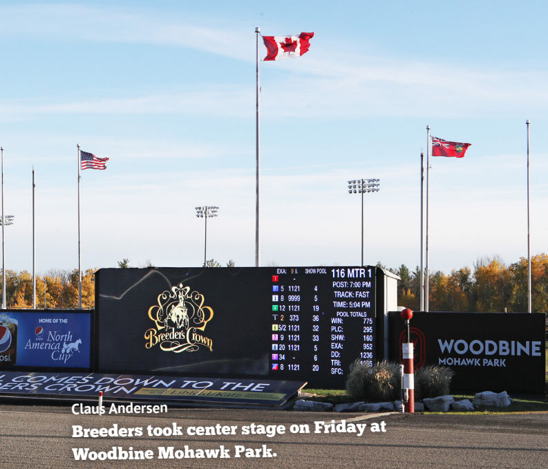
Breeders took center stage on Friday at Woodbine Mohawk Park.

His comments came in the winner's circle following homebred Special Way's triumph in the $810,000 Breeders Crown final for freshman fillies. The Walner—Special Hill 2-year-old captured the championship event in a track and Canadian record 1:52 performance.