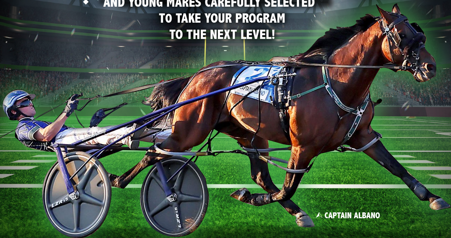
▲ CAPTAIN ALBANO

ALL AMERICAN HARNESSBREDS PHASE I DISPERSAL SELLING AT THE STANDARDBRED MIXED SALE NOVEMBER 7, 2024