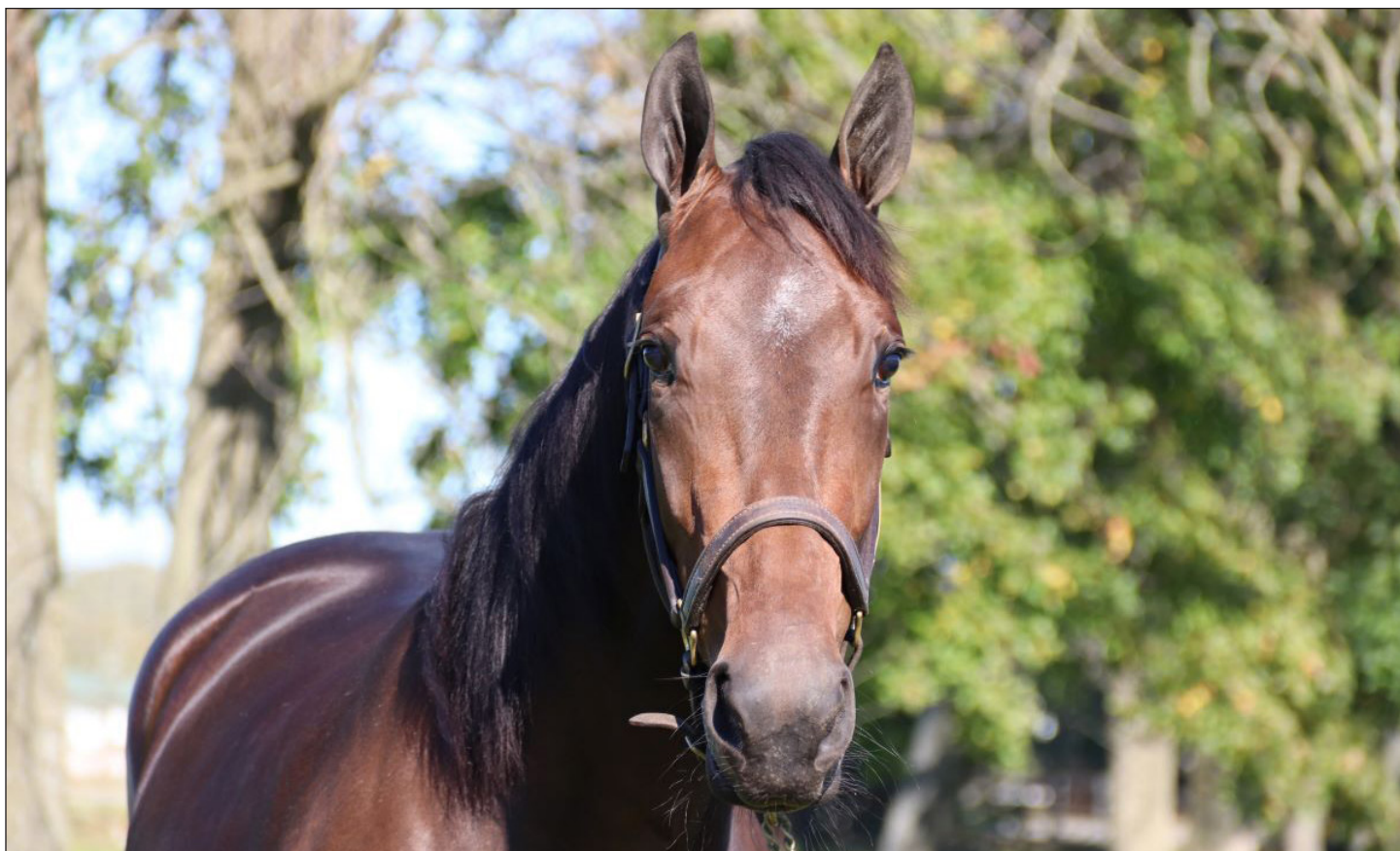
Ken Weingartner / USTA