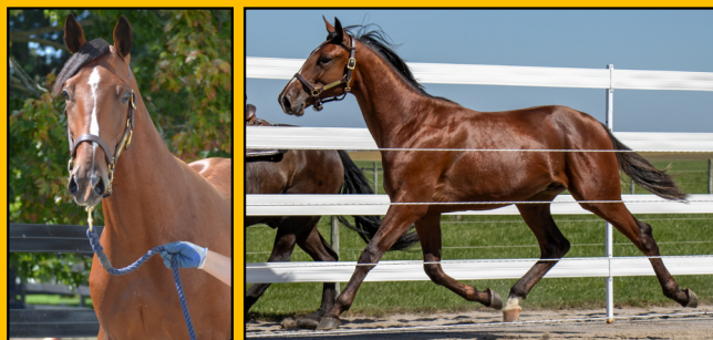
Hip #42 Solar Voltage bc

Always B Miki – Solar Sister – Mach Three