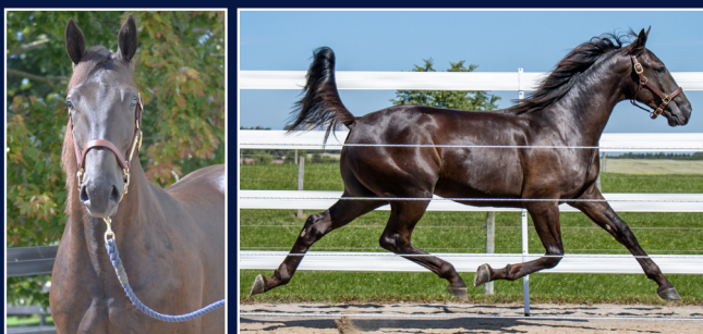
Hip #173 Cady Hill brc

Bulldog Hanover – Miss Mary Lou – Art Major