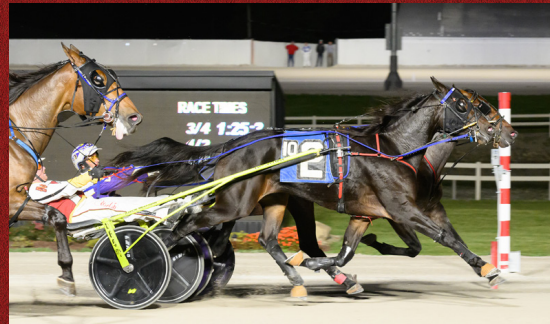
HUNG OVER 3-Year-Old Colt Trotting Champion