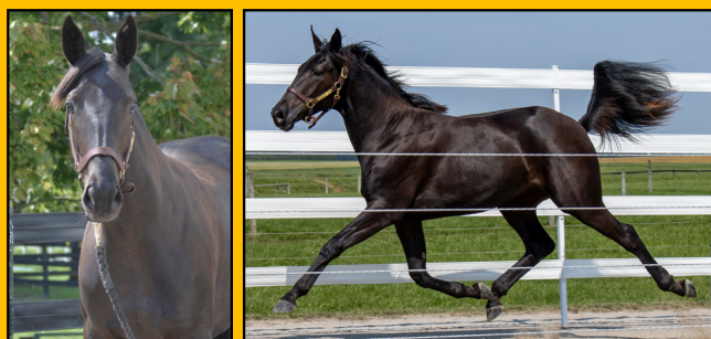
Hip #177 Windrush brf

Captain Crunch – Muskoka Moonlight – Shadow Play