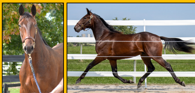
Hip #809 Colnago bc

Captain Crunch – Delizabeth – Bettors Delight