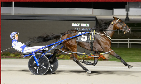
SEASIDE DIVA 3-Year-Old Filly Pacing Champion