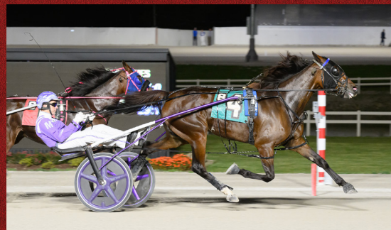
SUGAR INSTEAD 3-Year-Old Filly Trotting Champion