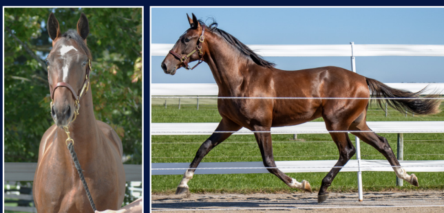
Hip #92 Brindle bc

Bulldog Hanover – Cabrini Hanover – Western Ideal