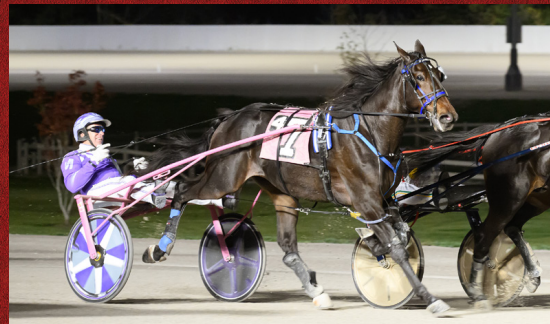
LT LOVERBOY 2-Year-Old Colt Trotting Champion