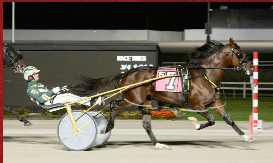
SIPPINONSEAROC 2-Year-Old Colt Pacing Champion