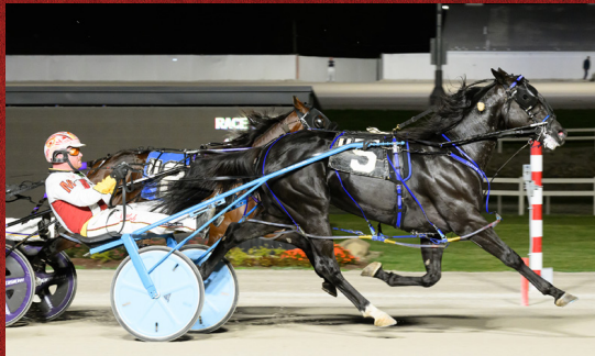
CLEVER CODY 3-Year-Old Colt Pacing Champion