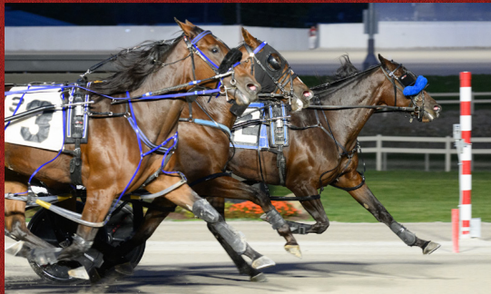
ODDS ON HIALEAH 2-Year-Old Filly Pacing Champion