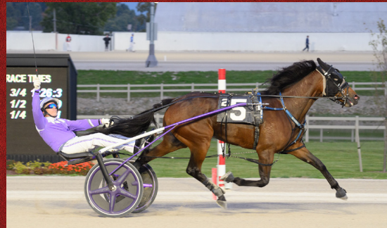
AUNT LAURA 2-Year-Old Filly Trotting Champion