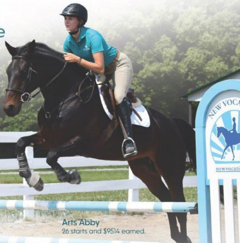
Arts Abby 26 starts and $9514 earned.

For more information, visit newvocations.org , email winnie@horseadoption.com or call (734) 320-7918.