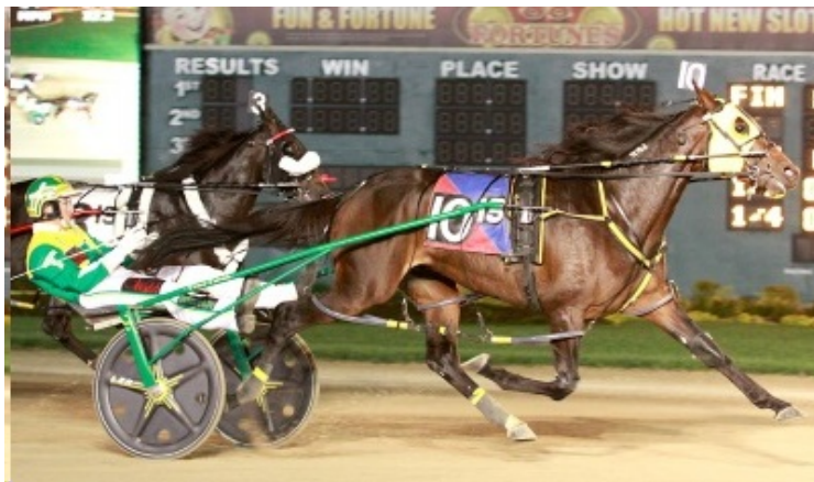
Freaky Feet Pete scores in the $200,000 Indiana Sires Stakes Super Final for 3YO pacing colts & geldings

ANDERSON, IN - Wiggle It Jiggleit is not headed for the Breeders Crown eliminations, but Freaky Feet Pete definitely is after beating the nation's top-rated horse Saturday night in a $200,000 Indiana Sires Stakes race at Hoosier Park.