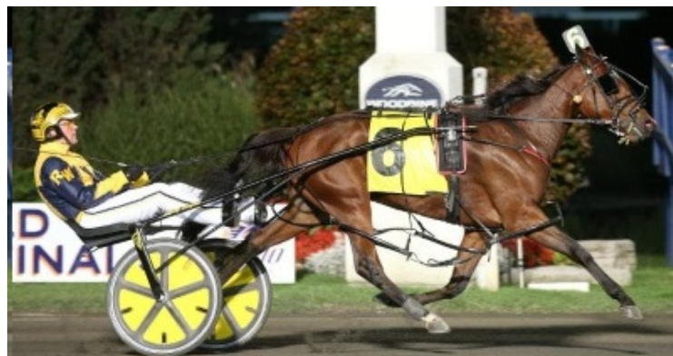
L A Delight

TORONTO, ON - L A Delight took longer than expected to make the front, but when she did she easily accelerated away from her overmatched foes in the $250,000 Ontario Sires Stakes Superfinal in 1:51 2/5.