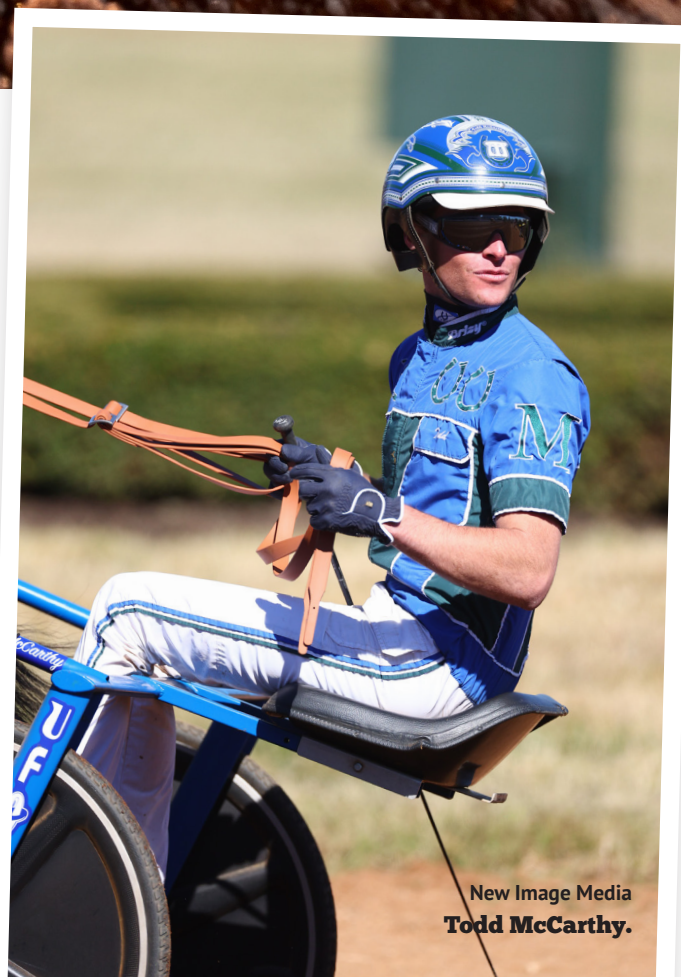
New Image Media Todd McCarthy.