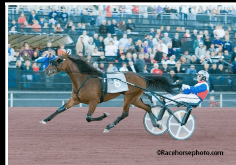
MARTINIONTHEROCKS (Conway Hall)