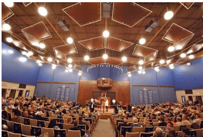
An optimistic crowd? Sales officials hope so.

Concord Stud Farm, Fox Den Farm, Hunterton Sales Agency, Northwood Bloodstock Agency, Peninsula Farm, Preferred Equine Marketing, Walnridge Farms, and Winterwood Farm will consign yearlings as agent. (Cont.)