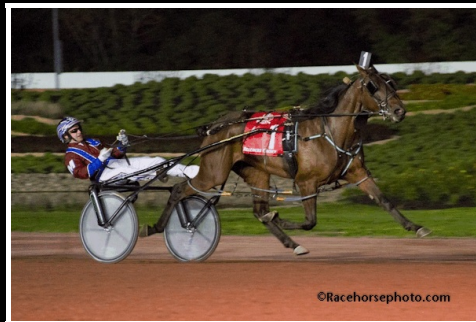
SEE YOU AT PEELERS (Bettor's Delight)