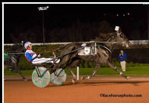
IMPRESSIVE KEMP (Credit Winner)

THERE ARE 138 NEW YORK-BRED YEARLINGS TO CHOOSE FROM IN THE LEXINGTON SELECTED SALE!