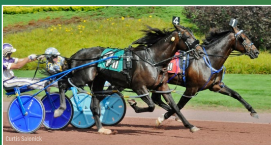
2021 Meadowlands Pace & Hempt Final Winner