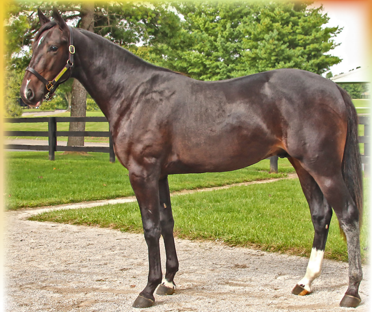
Hip# 384 • Tactical Wind TACTICAL LANDING (NJ) colt. Grand dam is a half-sister to CR KAY SUZIE (M) 2,1:55.1; 3,1:52.4; 4,1:52.3 ($1,732,092-Int.)