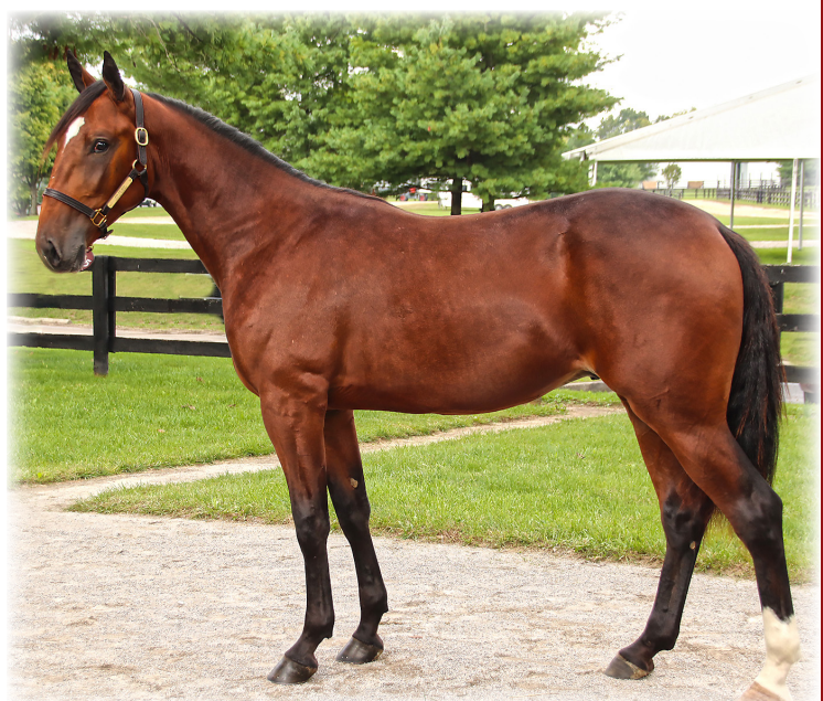
Hip# 545 • Pin Up Boy CANTAB HALL (PA) colt, half-brother to LOOKSLIKEACHPNDAL 1:51.1 ($497,953).