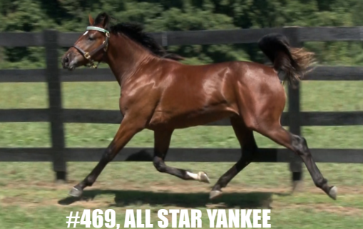
#469, ALL STAR YANKEE