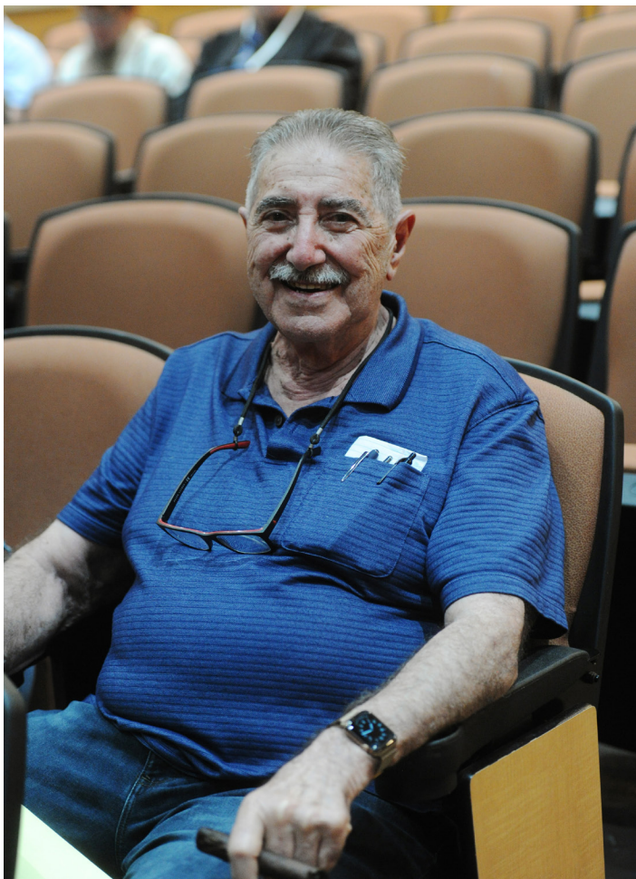
Adam Ström / stalltz

As for online bidding, the Proxibid platform sold two horses on opening night, one for $90,000 and another for $260,000. On Wednesday, 13 were sold online for a total of $929,000. Online bidders were the underbidders on 14 yearlings on night two,