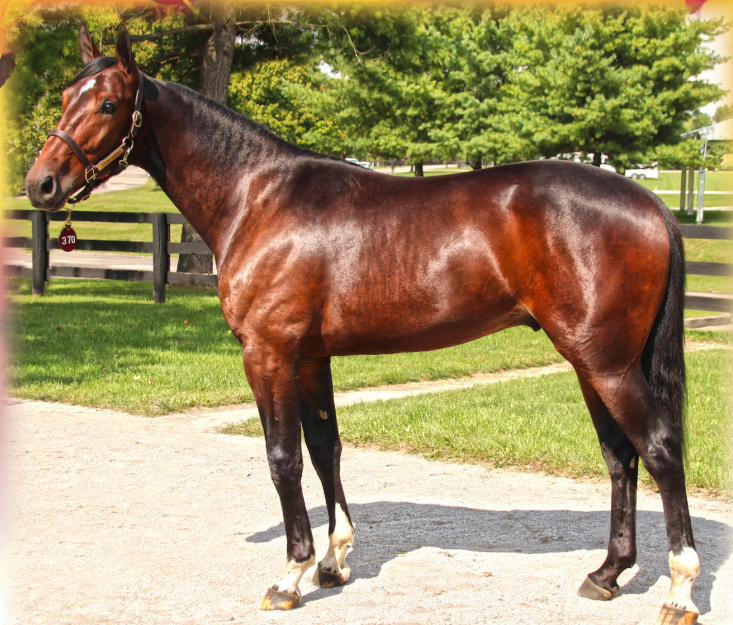
Hip# 370 • Muscleonamission MUSCLE HILL (NJ) colt, full brother to 3 in 1:55, including, EVELYN (M) 2,1:55.2f; 3,1:52.2f ($305,222) and HANNAH (M) 2,1:56h; 3,1:53.3f ($133,873), etc.