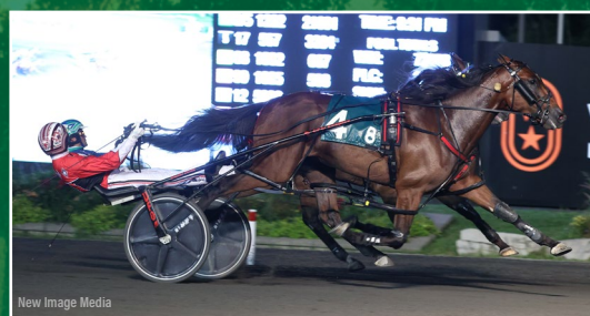
2021 Fan Hanover Final Winner