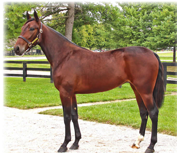
Hip# 402 • Broadway Sensation BAR HOPPING (PA) filly, half-sister to REGAL WOMAN (M) 3,1:57.4f; BT1:56.3f ($85,607), etc..