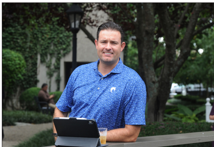
Adam Ström / stalltz

Sixty-one yearlings sold for at least $100,000 on Wednesday, compared to 31, 40 and 36 that hit six-figures in 2020, 2019 and 2018, respectively, during the second session.