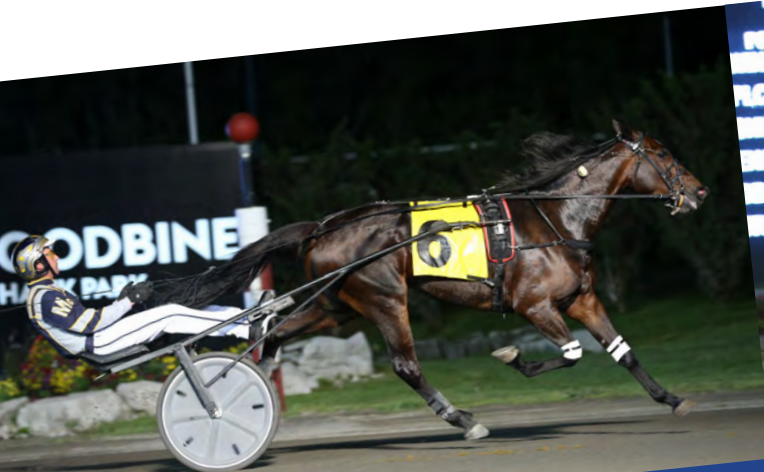
EMOTICON HANOVER 1:50.2f ($1,437,562)

Winning races against the best in North America!