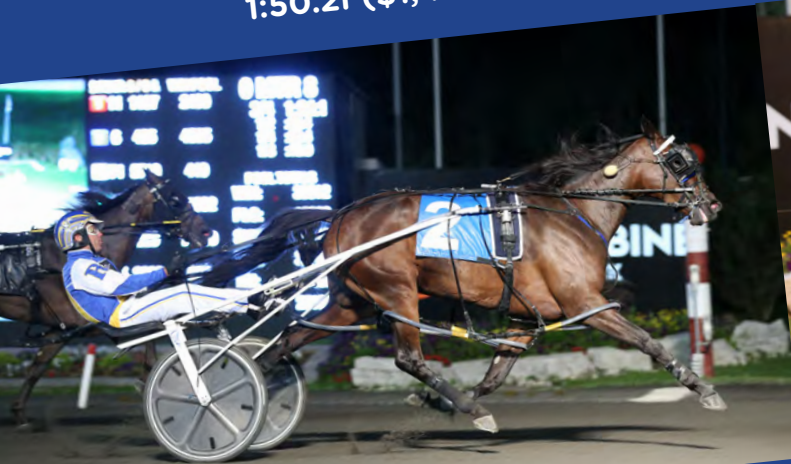
SHOWER PLAY p,3,1:50.2s ($516,800)