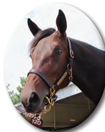
Hip# 120 • Regal Seven CHAPTER SEVEN colt, first foal from CATCHING KATIE 3,1:55f ($186,735).