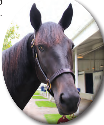
Hip# 162 • Seven Links CHAPTER SEVEN filly, half sister to OOOTEENY 3,2:00.3h-'18 ($42,248).