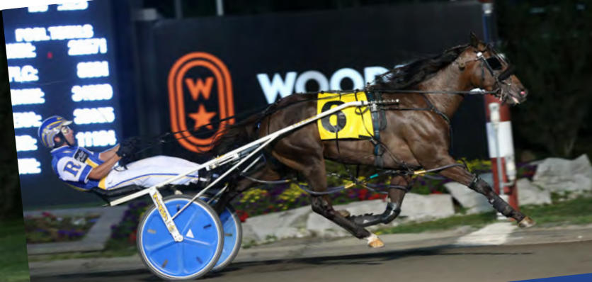
JIMMY FREIGHT p,3,1:48.3s ($756,791)