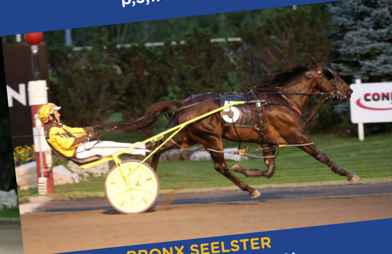
BRONX SEELSTER p,2,1:51.2s -'18 ($341,810)

Race in the lucrative OSS program. Buy an Ontario-Sired yearling this fall!