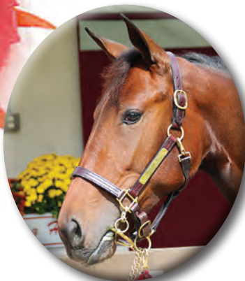
Hip# 226 Loved The Irish FATHER PATRICK filly, first foal from a full sister to MILLIGAN'S SCHOOL 3,1:53.2f ($595,000-Int.).