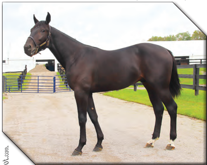
Hip# 143 • Seventimesseventy CHAPTER SEVEN colt, half brother IT REALLY MATTERS 4,1:52.4f ($321,505).