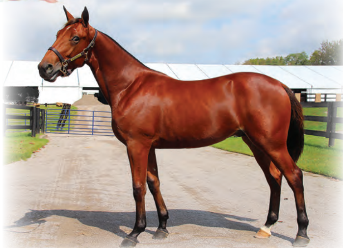
Hip# 246 • My Brother Jack FATHER PATRICK colt, half brother to MILLIGAN'S SCHOOL 3,1:53.2f ($595,000-Int.).