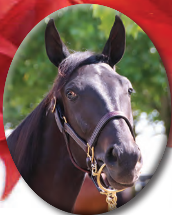
Hip# 188 Seventh Wonder CHAPTER SEVEN colt, half brother to L DEES COURAGEOUS 3,1:56.3-'18 ($50,951).

Visit our Lexington Consignment Located in Barn 12 • Aisles A – E