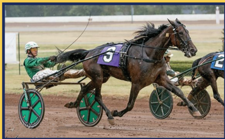
BEAUTIFUL SIN 3,1:50.1 ($406,289)

Selling her Muscle Hill full brother, the mare's first colt, ROBERTSIN , as Hip #2.