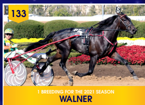
1 BREEDING FOR THE 2021 SEASON WALNER 3.1:50.2 ($567,652) BAY HORSE FOALED APRIL 12, 2014

Thank you to Victory Hill Farms, and JK Endofanera Partners for donating one 2021 breeding.