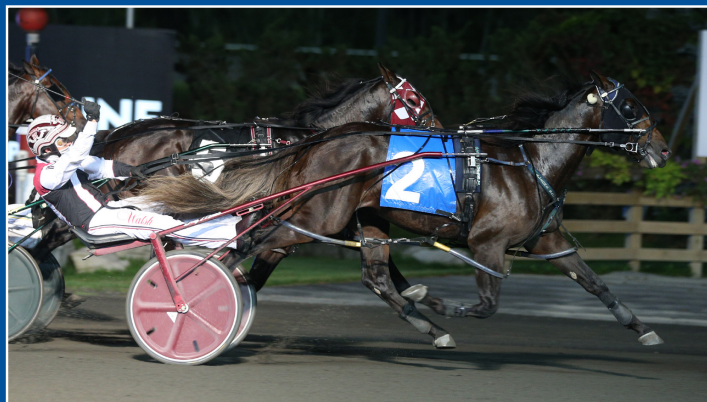
2PC EXPLOIT p, 2, 1:50.4S ($295,689) Somebeachsomewhere – Time On My Hands

Winner $1.32M Mohawk Million Final in 1:53.2 from the second tier