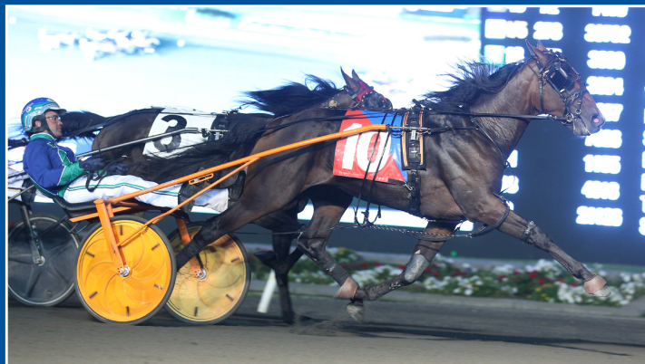
2TC VENERATE* 2, 1:51.4M ($683,766) Love You – Peaceful Kemp

We congratulate this past week's winners: