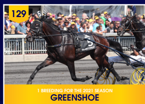
1 BREEDING FOR THE 2021 SEASON GREENSHOE 3.1:49.4 ($1,353,772) BAY HORSE FOALED JANUARY 29, 2016