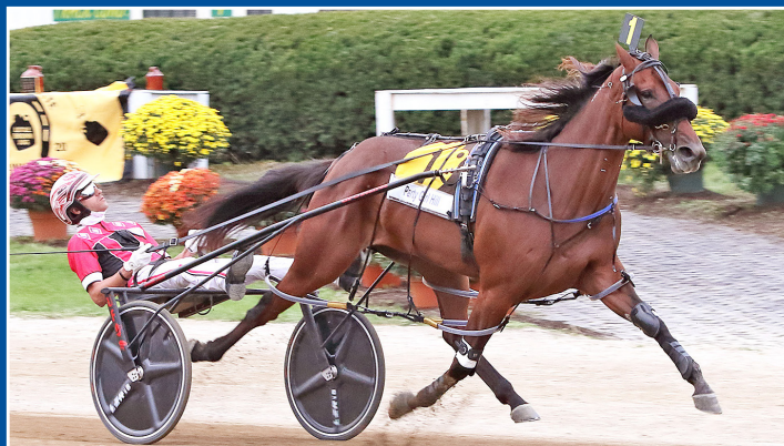
3PF PARTY GIRL HILL p, 3, 1:48.4F ($577,270) Captaintreacherous – Look Cheap

Winner Moni Maker at Hoosier wire to wire in 1:54.1