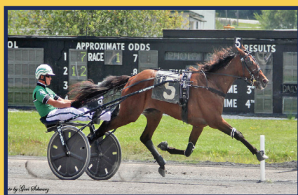
SEVENTIMESALADY 2,1:56.4s ($248,218)

Selling her first filly, and from the first crop of Walner, WALNERIAS STAR , as Hip #173.