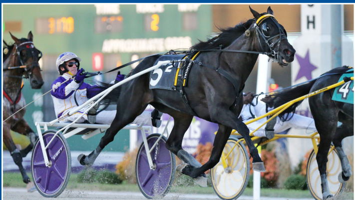
3TF CRUCIAL** 3, 1:52.4F ($484,696) Father Patrick – Jolene Jolene

Winner $720,000 Metro Final in 1:50.4 in first up fashion