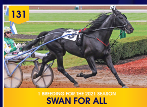
1 BREEDING FOR THE 2021 SEASON SWAN FOR ALL 3.1:54.1F ($309,986) BAY HORSE FOALED MAY 25, 2006