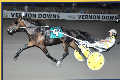
NON STICK 3,1:54S ($587,890)

Selling her Muscle Hill full brother, the mare's first colt, ROBERTSIN , as Hip #2.