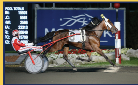
ALLERAGE STAR 1:52.3f ($420,090)

Selling her first foal, a Muscle Hill filly, NONNA BELLA , as Hip #25.