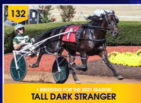
1 BREEDING FOR THE 2021 SEASON TALL DARK STRANGER P.3.1:47.1-20 ($1,741,645) BAY COLT FOALED MARCH 12, 2017