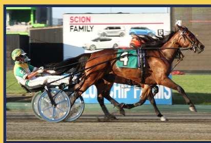
MA CHERE HALL 3,1:52.3 ($689,833)

Selling her Muscle Hill half-brother, the mare's first colt, MUSCLE MAVARICK , as Hip #225.