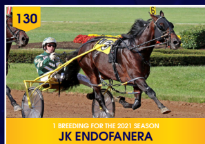
1 BREEDING FOR THE 2021 SEASON JK ENDOFANERA P.3.1:48.2 ($2,049,580) BAY HORSE FOALED FEBRUARY 28, 2011