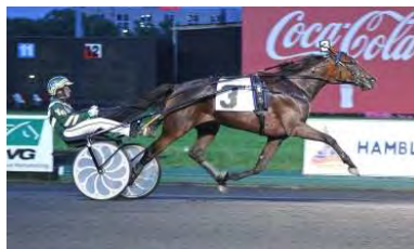
Maven will try to turn the tables on Check Me Out today at The Red Mile