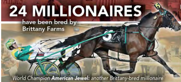
World Champion American Jewel: another Brittany-bred millionaire

More are on the way in this week's Lexington yearling consignment!