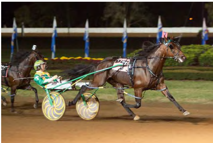
The Captain did it again last night at the Red Mile

LEXINGTON, Ky. - The exciting young pacer Captaintreacherous (Somebeachsomewhere) contributed to a big evening for his connections with a popular victory in his division of the Bluegrass Series event for two-year-old pacing colts and geldings Saturday night at the Red Mile.