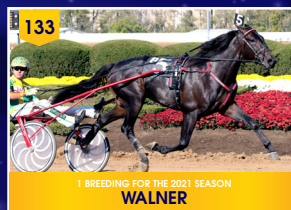
1 BREEDING FOR THE 2021 SEASON WALNER 3.1:50.2 ($567,652) BAY HORSE FOALD APRIL 12, 2014

Thank you to Victory Hill Farms, and JK Endofanera Partners for donating one 2021 breeding.