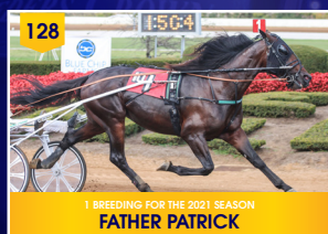
1 BREEDING FOR THE 2021 SEASON FATHER PATRICK 3.1:50.2F ($2,558,133) BAY HORSE FOALD MARCH 12, 2011

The 2020 Lexington Selected Yearling Sale will be held on October 6 at 6:45 PM at the Fasig Tipton Sales Pavilion. Plus, enjoy a cocktail hour in the Kentucky Room at 5:30 PM. All proceeds of the Breeders Crown Charity Challenge will be donated.