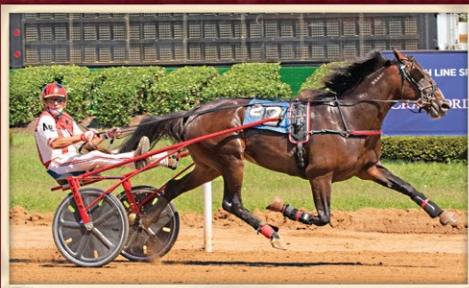
D Farm's CUATRO DE JULIO Multiple SW; year's co-fastest 2YO trotter