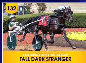
1 BREEDING FOR THE 2021 SEASON TALL DARK STRANGER P.3.1:47.1-20 ($1,741,645) BAY COLT FOALD MARCH 12, 2017