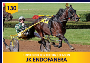
1 BREEDING FOR THE 2021 SEASON JK ENDOFANERA P.3.1:48.2 ($2,049,580) BAY HORSE FOALD FEBRUARY 28, 2011