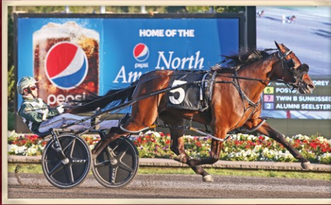
Caviart Farms' CAVIART AUDREY Multiple stakes winner incl. SAGL Elim