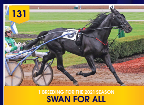
1 BREEDING FOR THE 2021 SEASON SWAN FOR ALL 3.1:54.1F ($309,986) BAY HORSE FOALD MAY 25, 2006