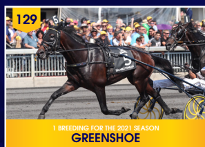
1 BREEDING FOR THE 2021 SEASON GREENSHOE 3.1:49.4 ($1,353,772) BAY HORSE FOALD JANUARY 29, 2016