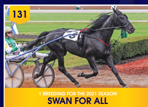
1 BREEDING FOR THE 2021 SEASON SWAN FOR ALL 3.1:54.1F ($309,986) BAY HORSE FOALED MAY 25, 2006