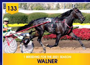
1 BREEDING FOR THE 2021 SEASON WALNER 3.1:50.2 ($567,652) BAY HORSE FOALED APRIL 12, 2014

Thank you to Victory Hill Farms, and JK Endofanera Partners for donating one 2021 breeding.