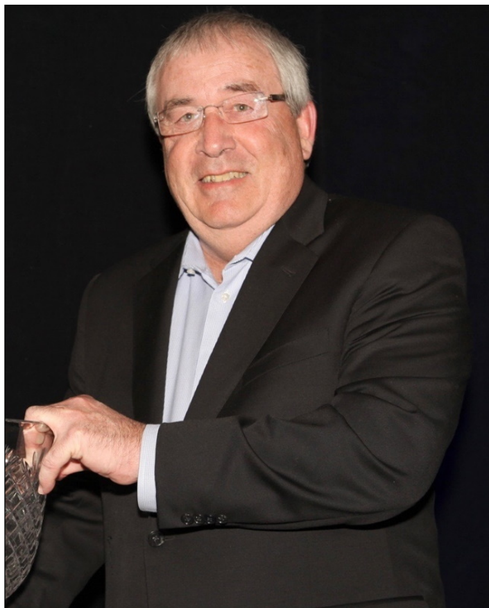
True Nature Communications

The inaugural Mohawk Million headlines Canada's richest night of racing with over $2.8 million on the line this Saturday at Woodbine Mohawk Park.