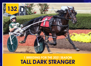
1 BREEDING FOR THE 2021 SEASON TALL DARK STRANGER P.3.1:47.1-20 ($1,741,645) BAY COLT FOALED MARCH 12, 2017