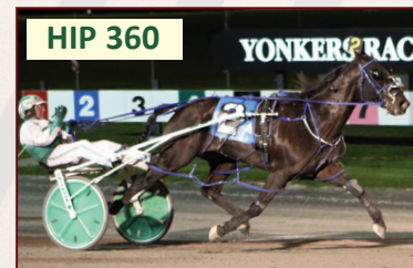
1st foal from a sister to DOMETHATAGAIN