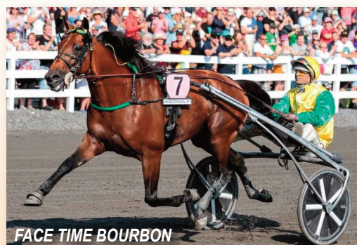
FACE TIME BOURBON