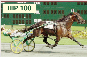
Filly from a sister to ARTISTIC FELLA

2021 yearlings at the Hoosier Classic Sale, October 22 & 23