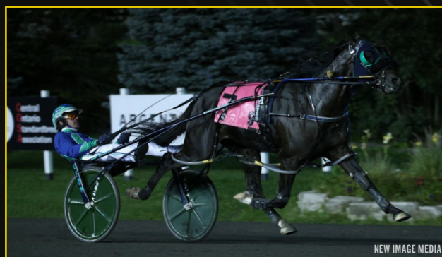
NEW IMAGE MEDIA