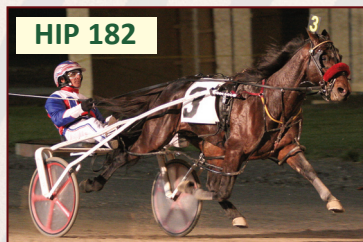
Half-brother to PALONE RANGER