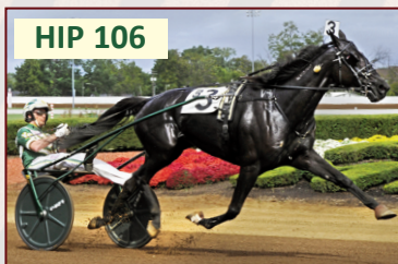
Colt from a sister to HANNELORE HANOVER