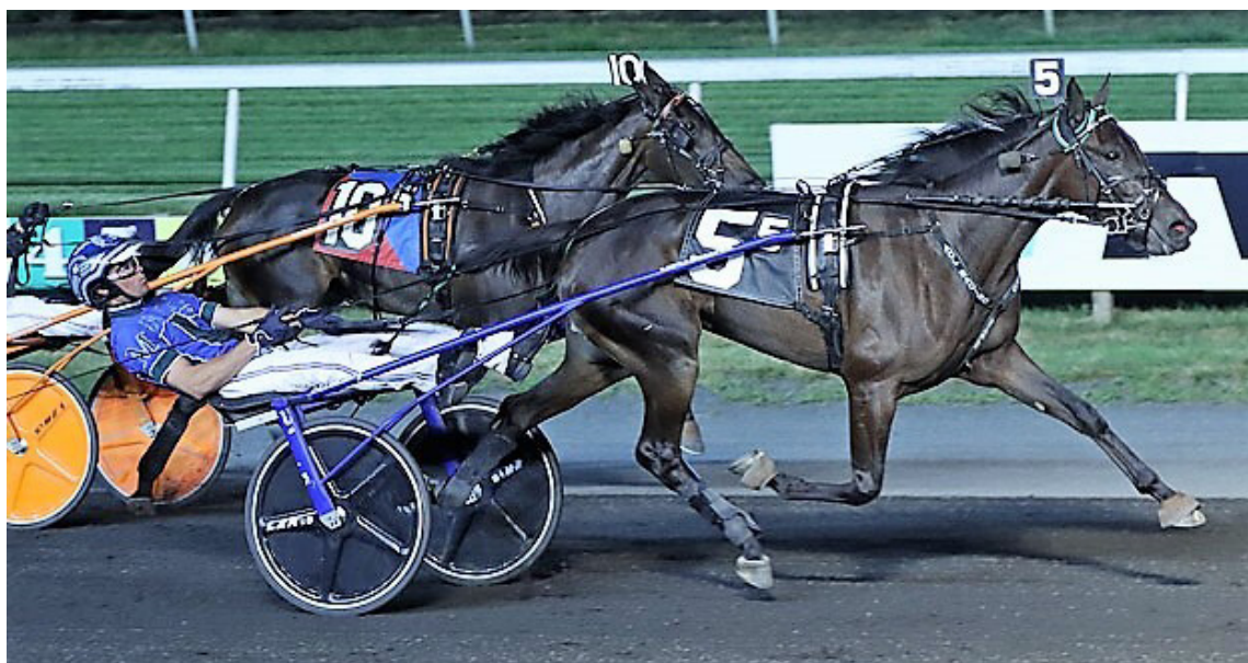
Lisa Photo Quick Stop (Todd McCarthy) winning at The Meadowlands.