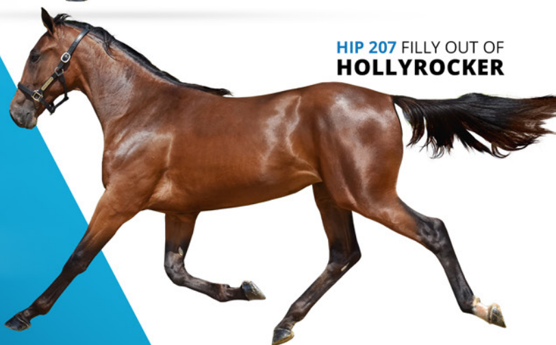
HIP 207 FILLY OUT OF HOLLYROCKER

FRIDAY, SEPT. 17, 2021 AT 10 A.M. PICKAWAY AGRICULTURE AND EVENT CENTER CIRCLEVILLE, OH