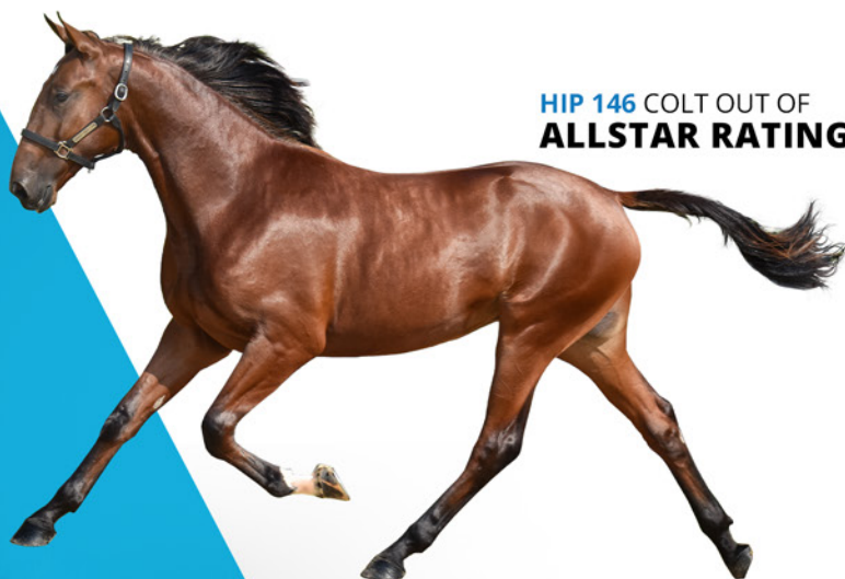
HIP 146 COLT OUT OF ALLSTAR RATING

LOOK FOR THESE OUTSTANDING SECOND-CROP YEARLINGS AT THE OHIO SELECTED JUG SALE