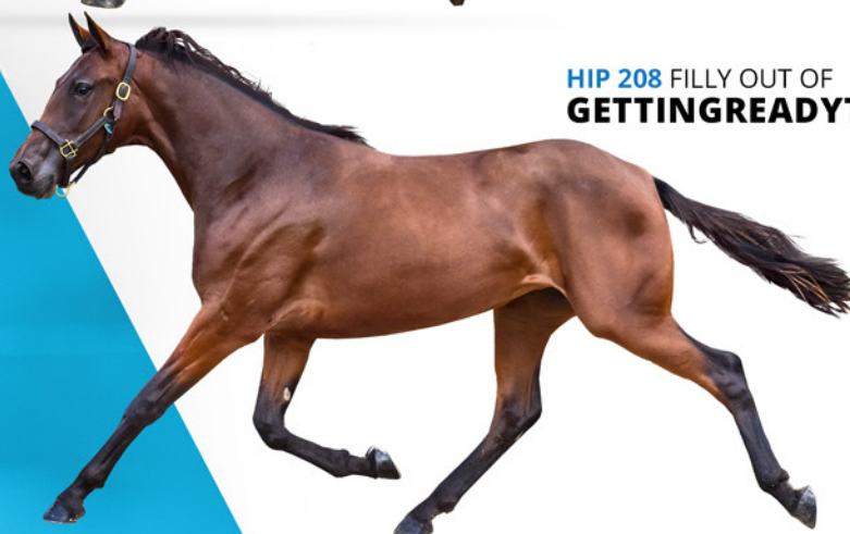
HIP 208 FILLY OUT OF GETTINGREADYTOROLL

VISIT OUR ENTIRE CONSIGNMENT IN BARN E, ROWS A, B, & E