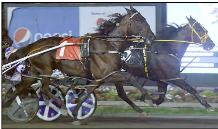
New Image Media