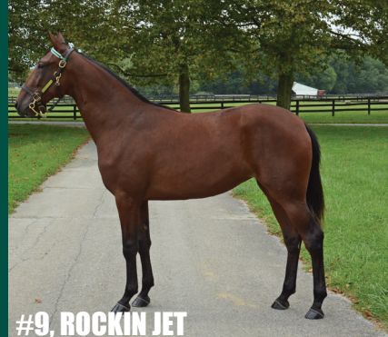
#9, ROCKIN JET

9/13 Goshen Yearling Sale Preview • 9/14 Goshen Yearling Sale