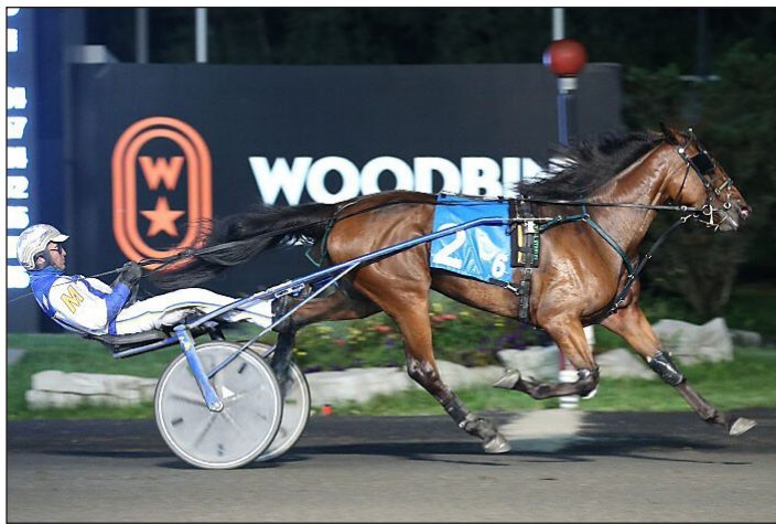
New Image Media

Letsdoit S went to the front and never looked back to win the $62,307 first Champlain division for colts and geldings in 1:56.