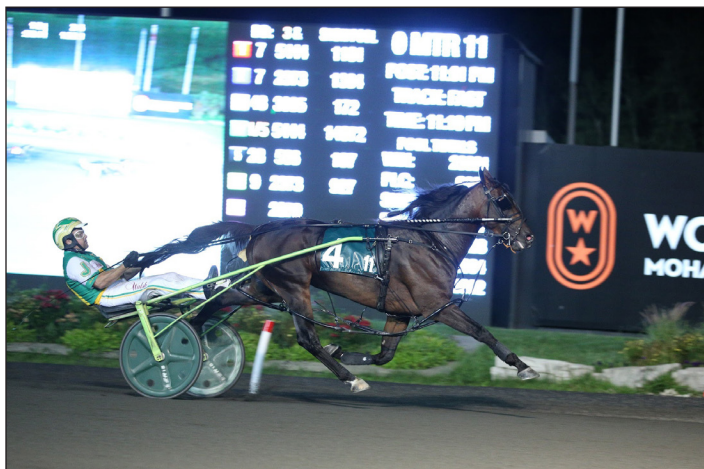
New Image Media

Bred by Steiner Stock Farm of Ohio, Whichwaytothebeach was purchased for $45,000 at the 2019 Lexington Selected Yearling Sale.