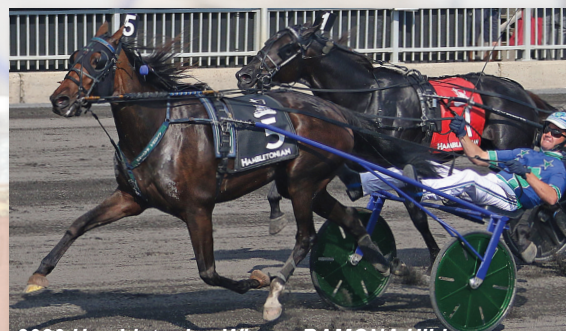
2020 Hambletonian Winner RAMONA HILL

You are what makes the Hambletonian special!