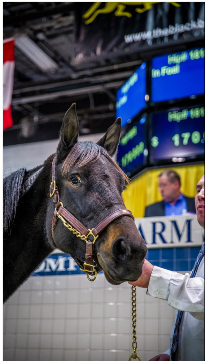
Triscari Video Web and Marketing