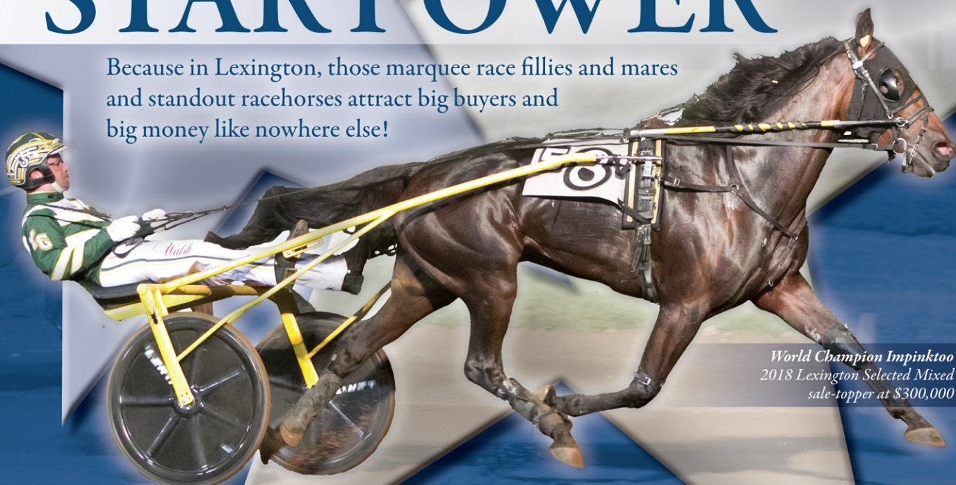
World Champion Impinktoo 2018 Lexington Selected Mixed sale-topper at $300,000

Because in Lexington, those marquee race fillies and mares and standout racehorses attract big buyers and big money like nowhere else!