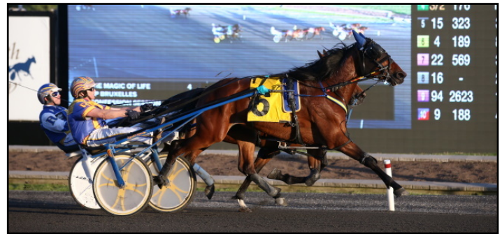
New Image Media

Since the sale, Warrawee Vicky has amassed three more wins, two of them in Ontario Sires Stakes Gold Series action, taking a mark of 1:55.4 in the July 11 Gold Series season