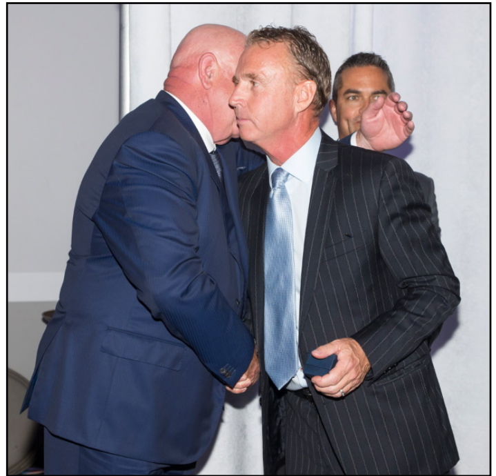
Canadian Horse Racing Hall of Fame

She went on to be a great broodmare, passing on determination to her offspring at Hanover Shoe Farms, where she still lives today at 29 years old in a field with retired mares