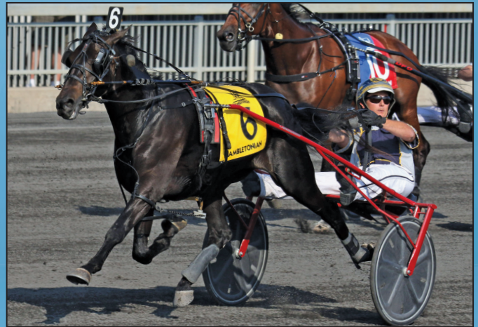
Hambletonian Winner FORBIDDEN TRADE