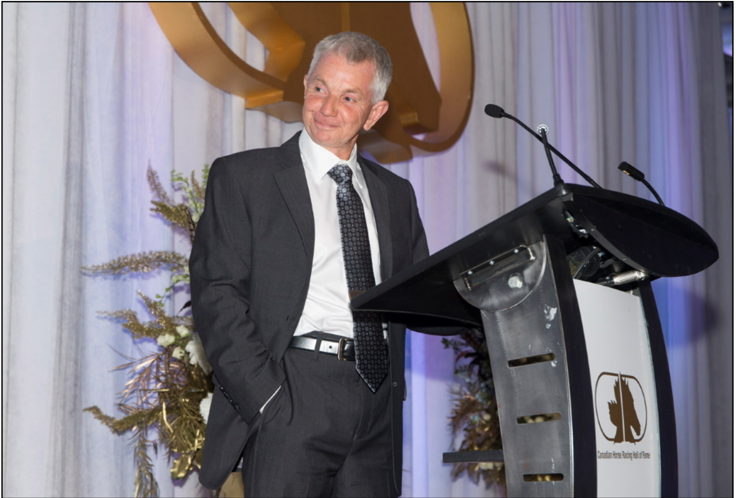
Canadian Horse Racing Hall of Fame