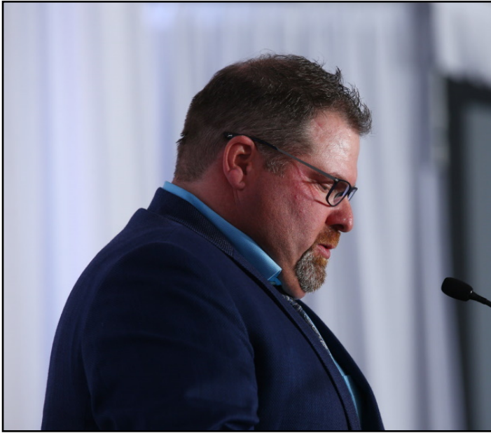
Canadian Horse Racing Hall of Fame