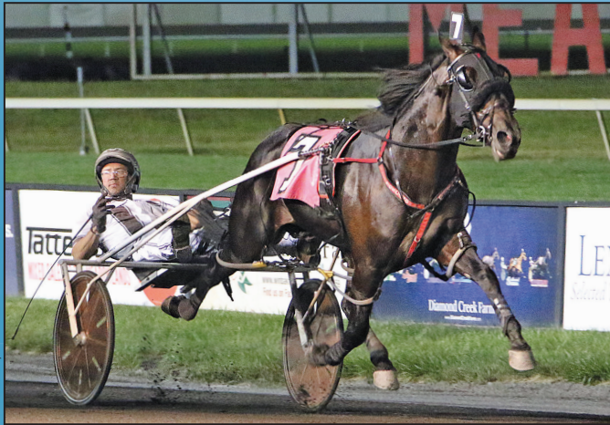
Meadowlands Pace Winner BEST IN SHOW