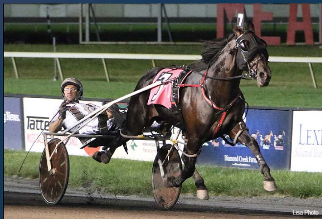
2019 Meadows Pace Winner