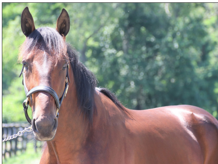
Ken Weingartner / USTA