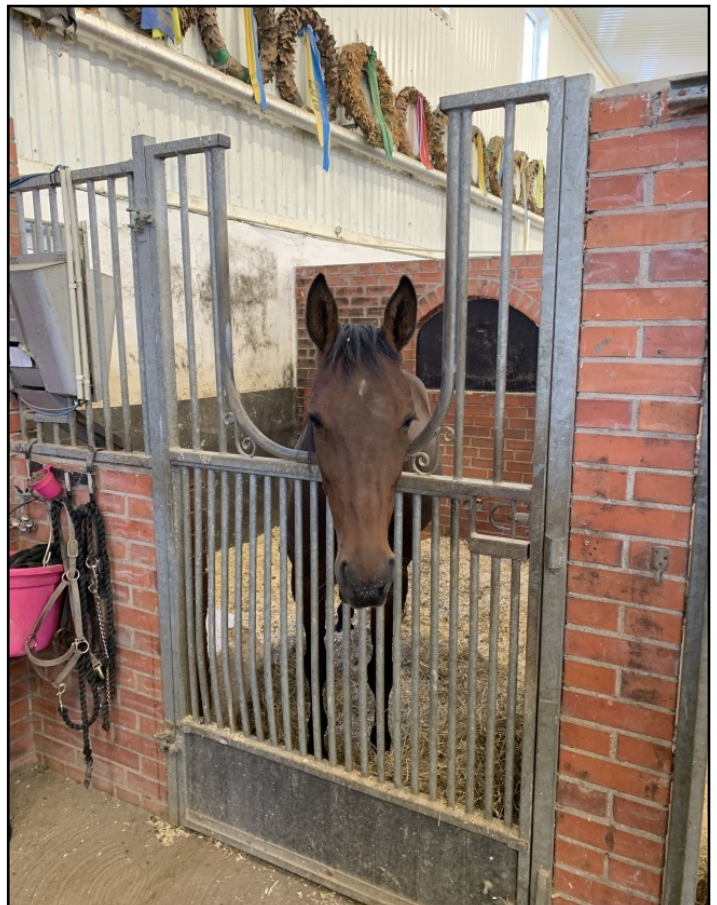
Delicious, currently in foal to Daley Lovin, is still the queen of the farm.