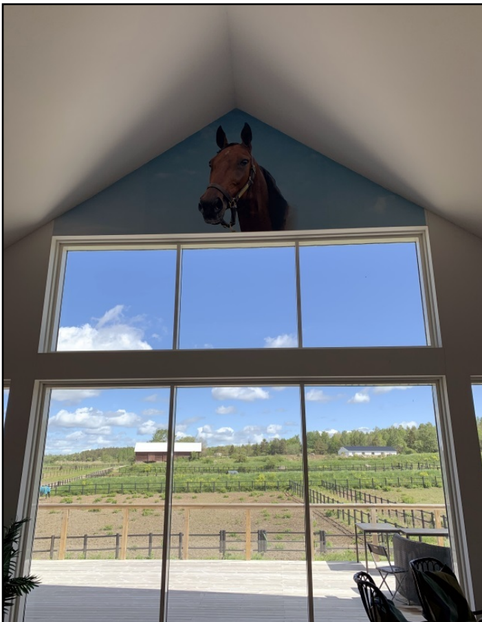
Beloved mare Delicious overlooks the lounge and farm.

Redén’s impressive level of success in a relatively short time is all documented in the expansive and pristine complex on the second floor of his main barn at the 740-acre farm named Furuby Gård. The farm is owned by the Ågerup family and located in Örsundsbro, Sweden, about 50 miles north of Stockholm. Here you will find a plethora of well-framed racing photos that line the walls that contain an office, kitchen, some small apartments and a large lounge with a deck overlooking the farm. Apart from providing an outstanding vista, the high-ceilinged lounge comes complete with a ping-pong table, deep massage chair, large leather couch and equally-large television and lots of racing trinkets. It’s all overseen by the patron saint of Furuby Gård, as depicted in a huge mural of beloved mare Delicious that looks down on it all from the apex of the roof on the wall leading out to the deck.