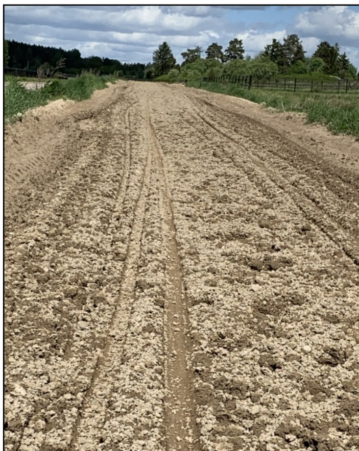
Redén hunted all over Sweden to find the right sand and clay mixture to build his deep straight track.

But more on black holes and the spiritual energy of