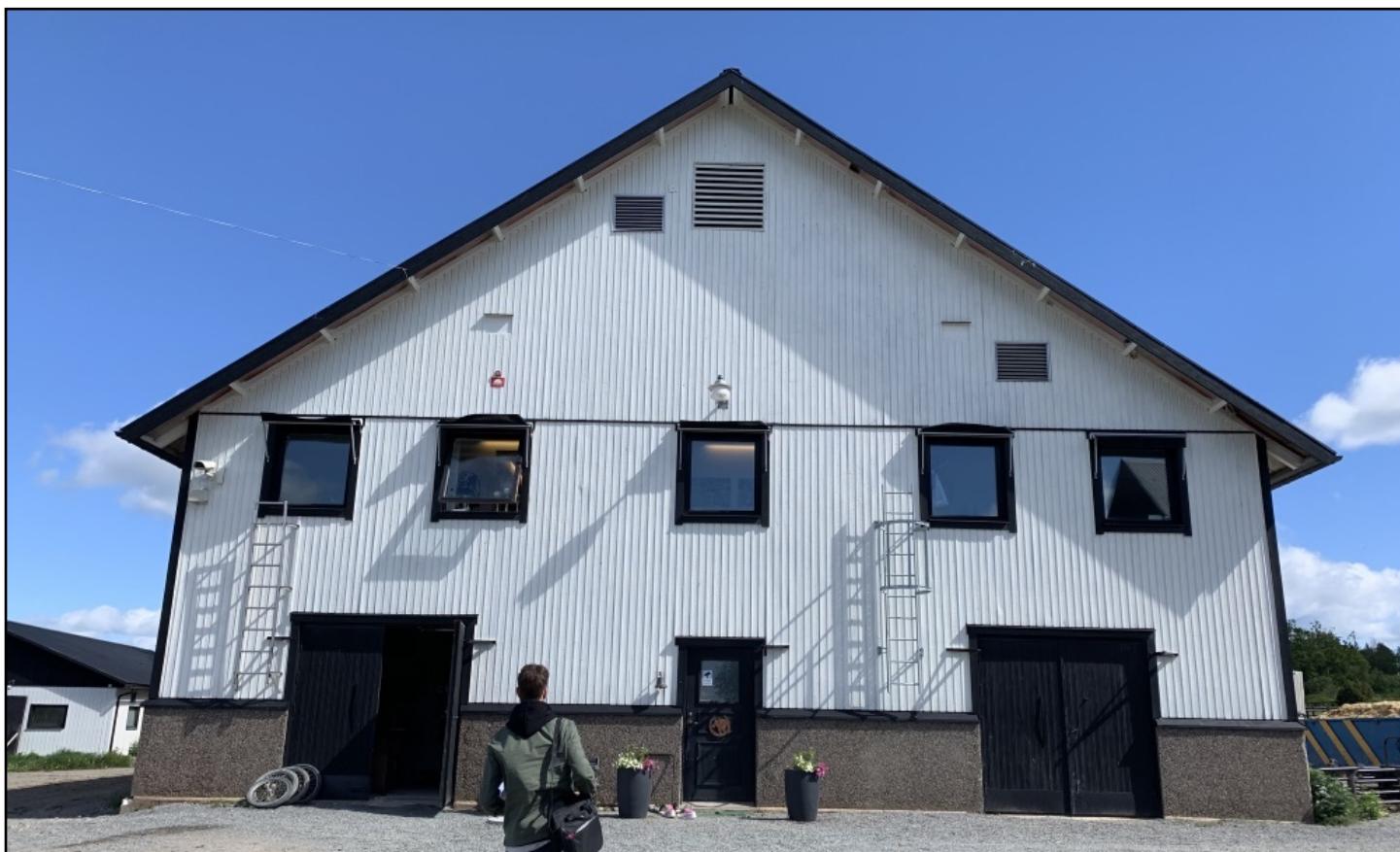
The main barn at Stall Zet houses the office, kitchen, some apartments, racing trophies and photos and an employee lounge complete with ping pong and a deck overlooking the farm.