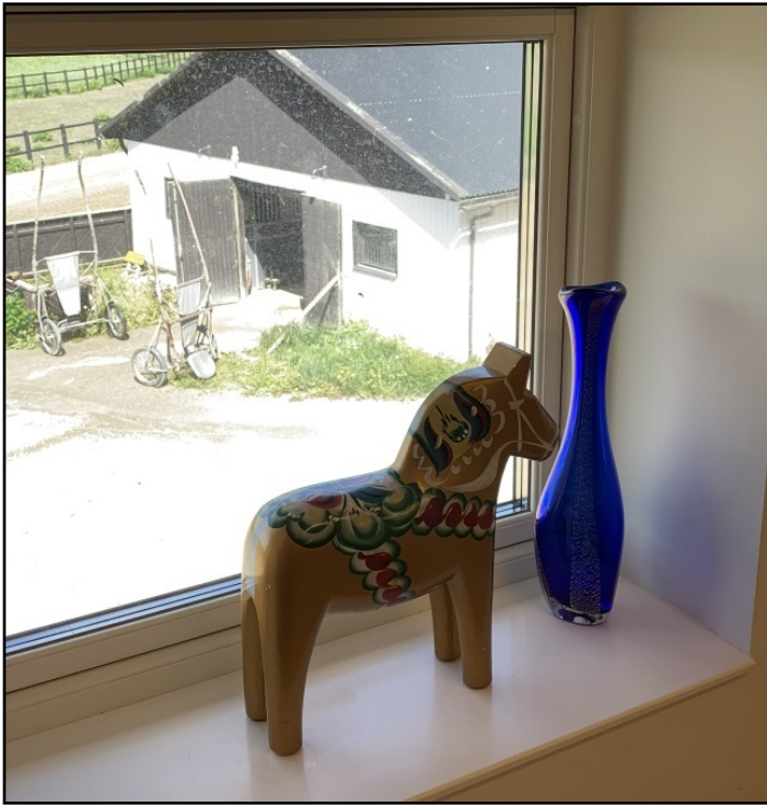
A Swedish Dala horse in the window.