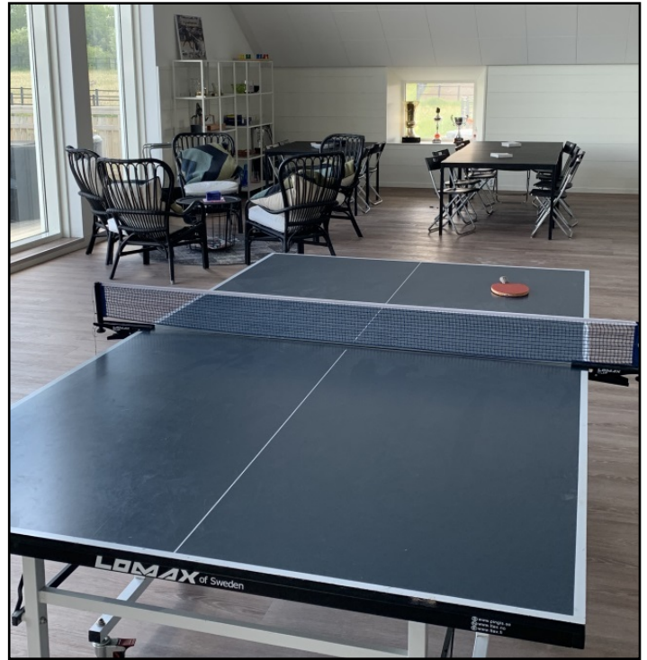
The ping-pong table in the employee lounge.