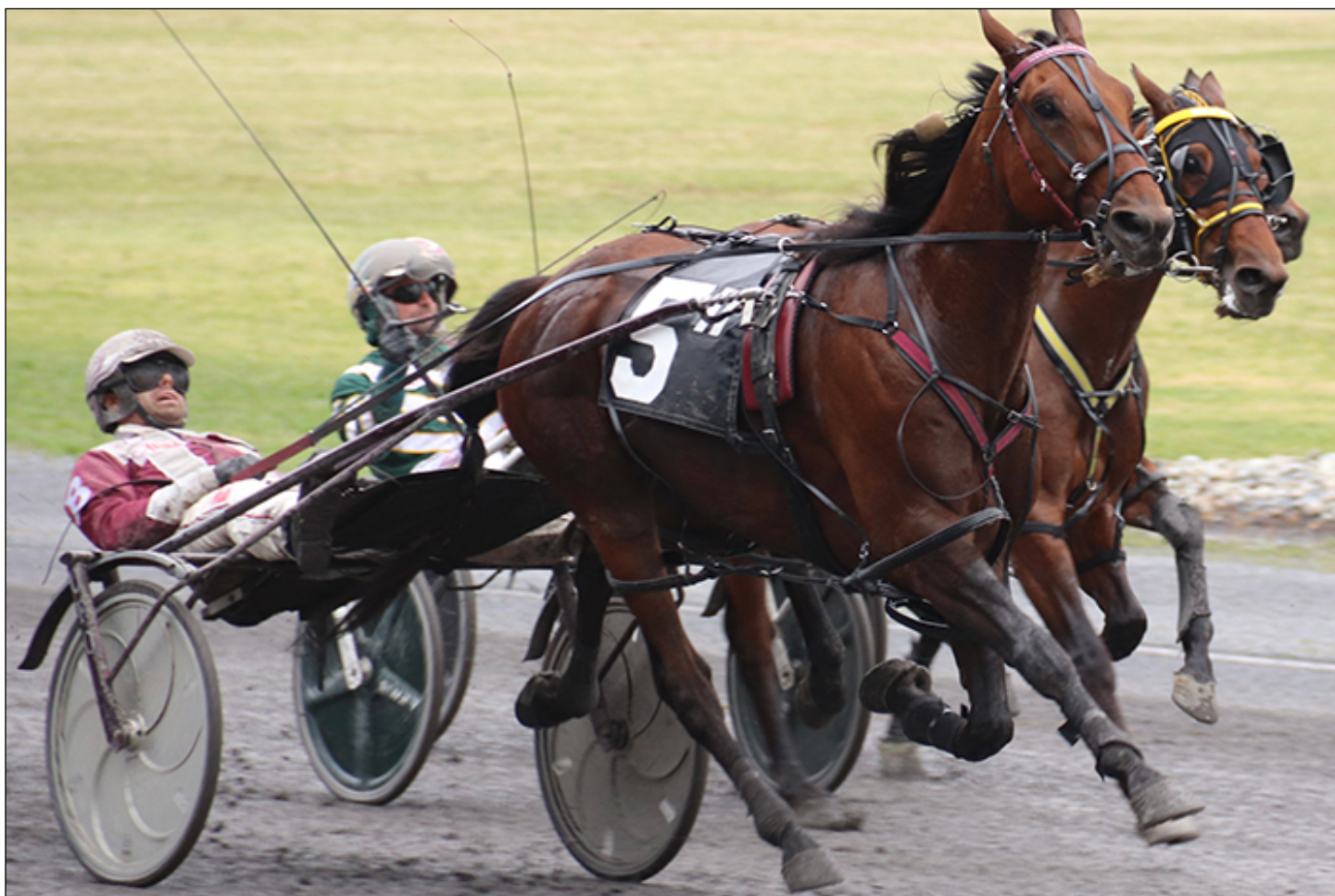
Ken Weingartner / USTA