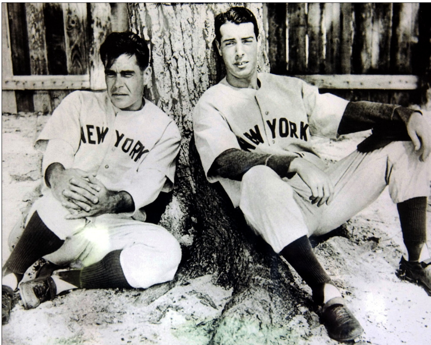
New York Yankees teammates Charlie Keller (left) and Joe DiMaggio. Keller went on to found Yankeeland Farms after retiring from baseball.

When he retired from baseball, Keller returned to his native roots in Frederick, MD. From then on, this kid is proud to say he knew Charlie Keller personally, and called him a friend.