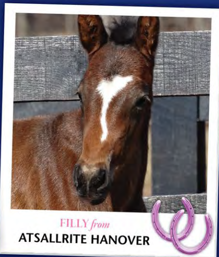
FILLY from ATSALLRITE HANOVER