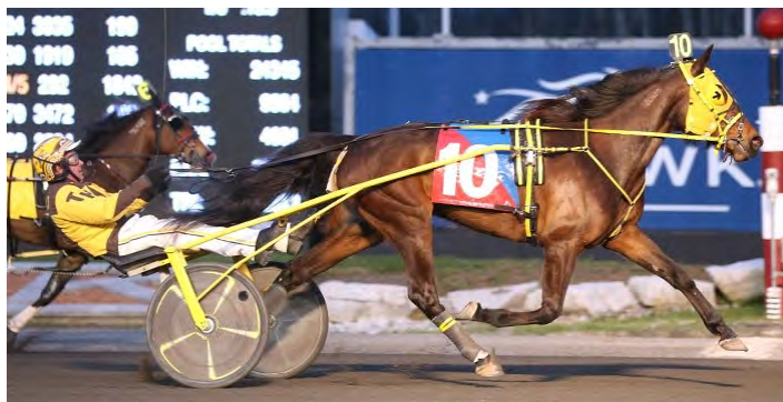
New Image Media

Wanaka overcame post position 10 to win the $33,200 Celas Counsel Trotting Series final for three-year-old trotting fillies Thursday night (April 28) at Mohawk Racetrack.