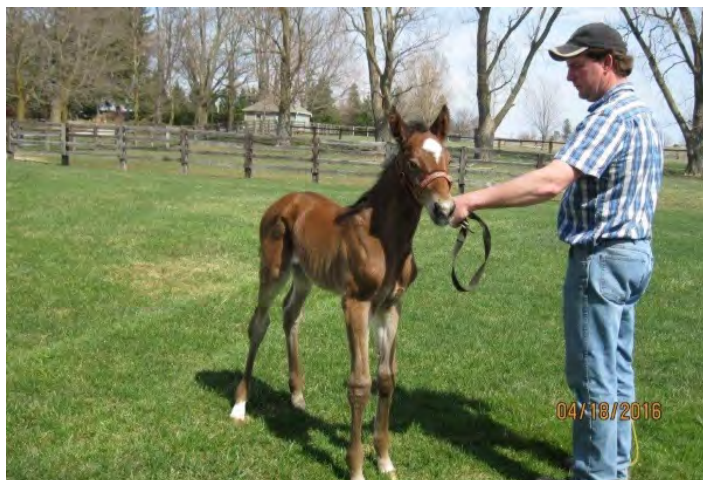
Filly out of Dover Miss