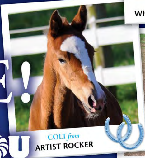
COLT from ARTIST ROCKER