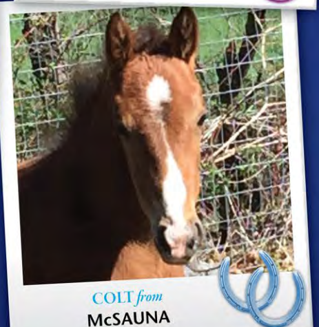
COLT from McSAUNA

#babyblaze SEE MORE ON TWITTER @GREATWHITEBLAZE