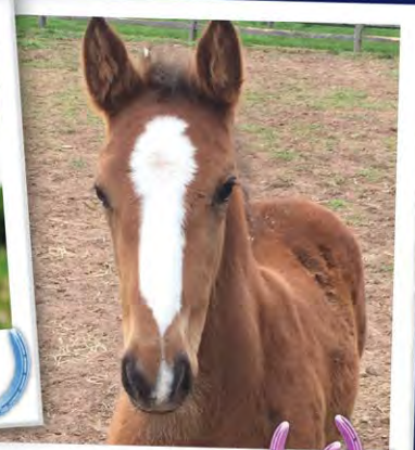
FILLY from HARD TO DESIRE