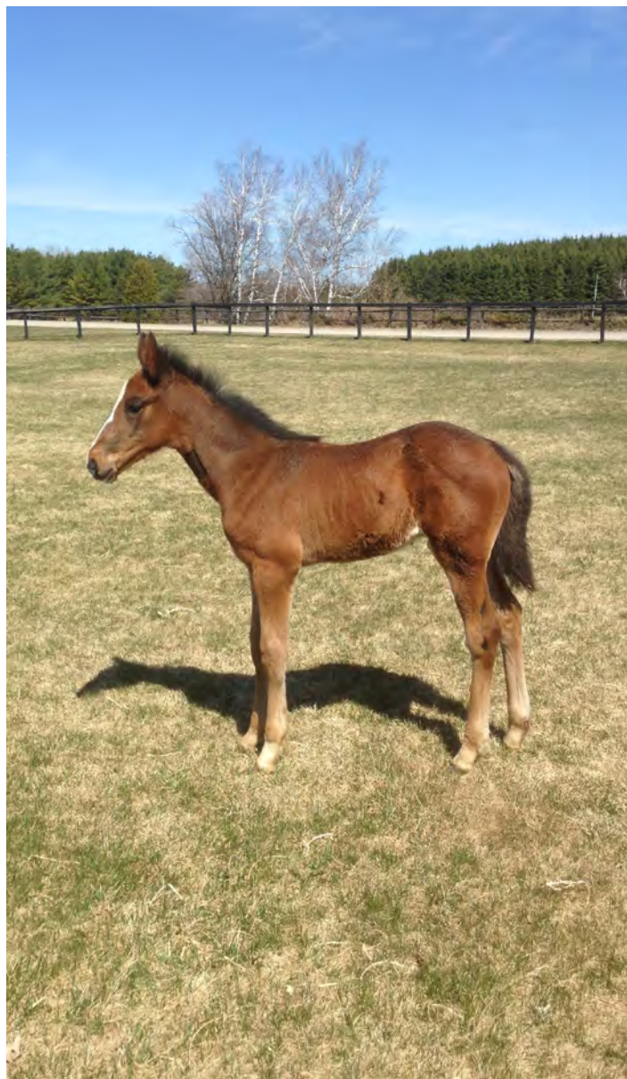
Filly out of Andover The Top