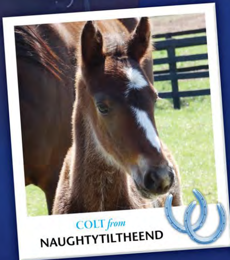
COLT from NAUGHTYTILTHEEND