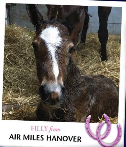
FILLY from AIR MILES HANOVER