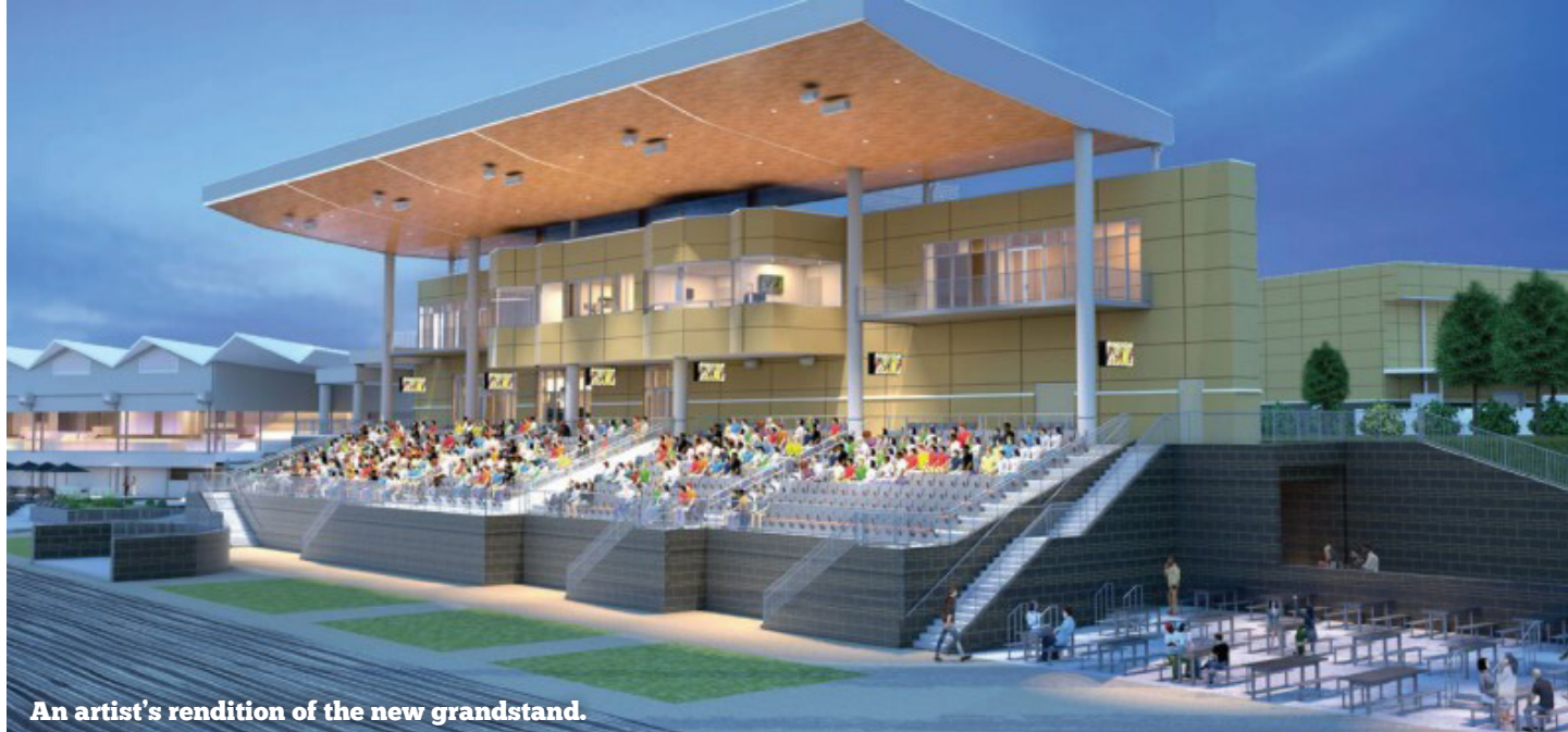
An artist's rendition of the new grandstand.