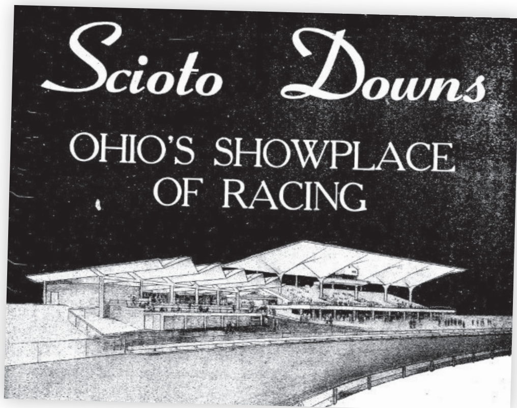
An ad showing the old grandstand at Scioto Downs

Roth also noted that the judges and photo finish will be housed in temporary quarters in the current winner's circle area.