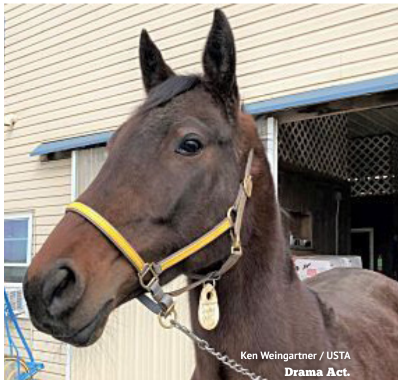
Drama Act.