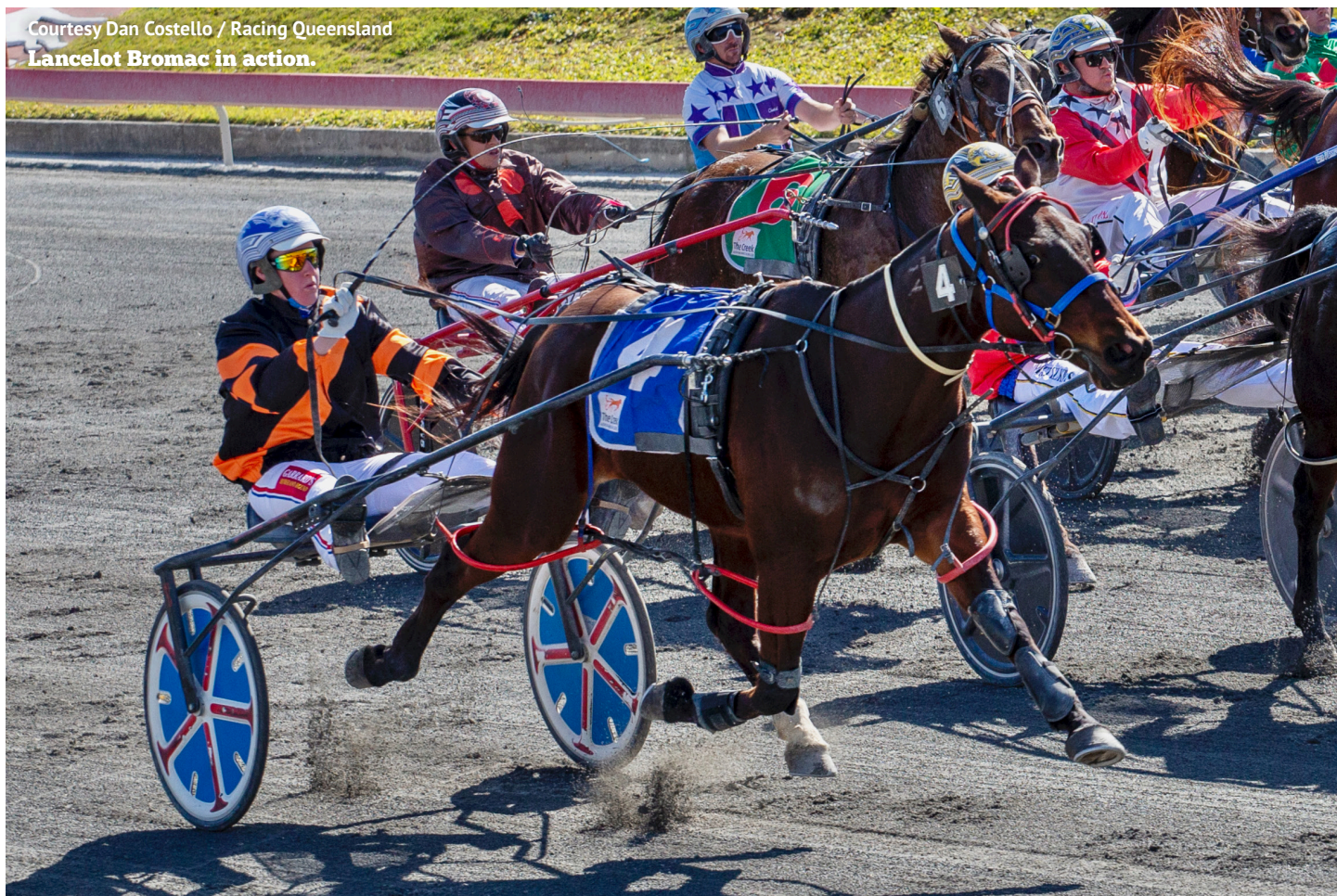
Lancelot Bromac in action.

That first race at the Gold Coast was an anomaly as Queensland’s home of harness racing, Albion Park, has been Lancelot Bromac’s playground.