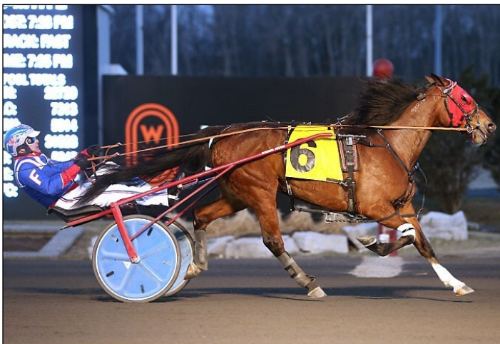
New Image Media

Winter series final action continues tonight (March 26) with the $40,600 Snowshoe and $40,400 Blizzard finals scheduled.