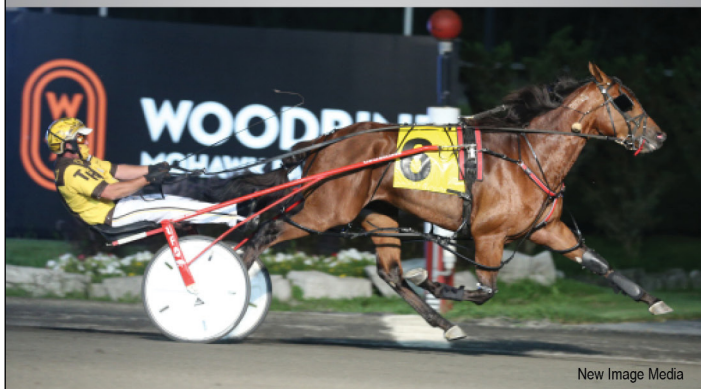
New Image Media

The FASTEST ever progeny of the great Captaintreacherous - 1:47.1