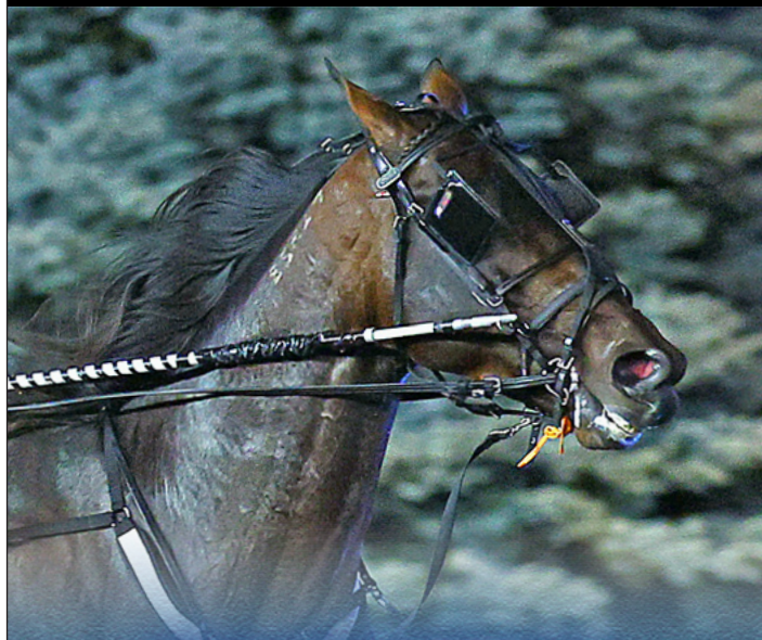
2022 Horse of the Year Bulldog Hanover Harrisburg Yearling Grad

Owners and trainers know they'll find future champions here, as 5 OF THE LAST 6 HORSES OF THE YEAR THAT WERE SOLD AS YEARLINGS WERE ALL SOLD AT HARRISBURG