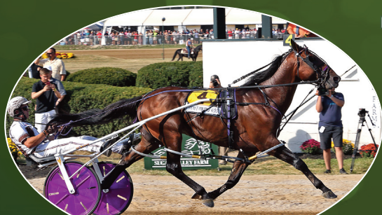
LITTLE BROWN JUG WINNER!

He finished second in the Tattersalls Pace, beaten by a head in 1:49.4.