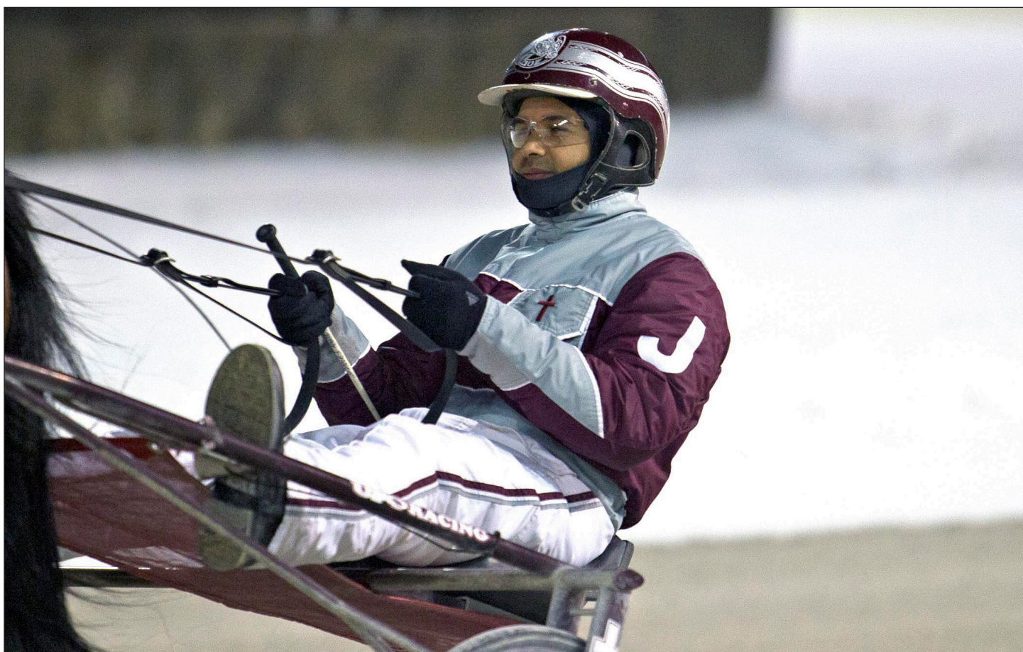
Four Footed Fotos

Indicative of Franco's popularity, one day last month when