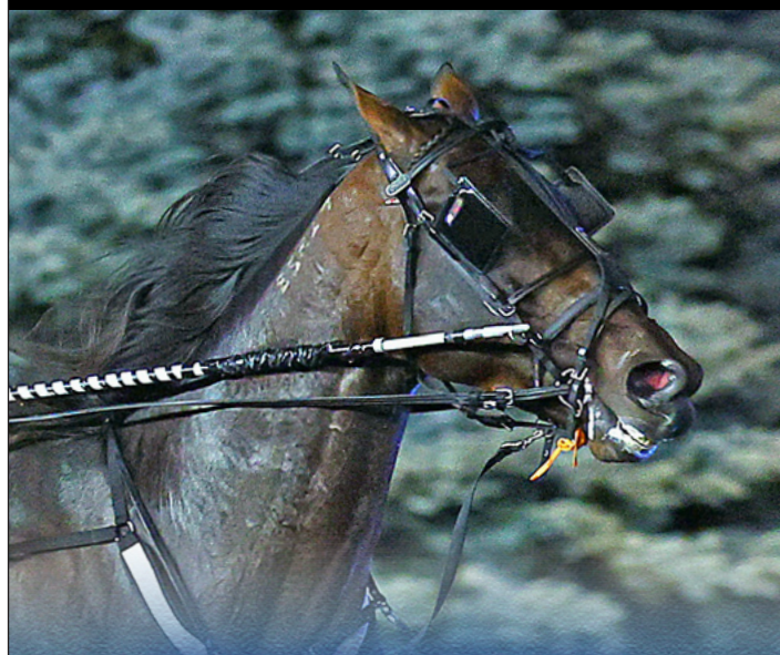
2022 Horse of the Year Bulldog Hanover Harrisburg Yearling Grad

Owners and trainers know they'll find future champions here, as 5 OF THE LAST 6 HORSES OF THE YEAR THAT WERE SOLD AS YEARLINGS WERE ALL SOLD AT HARRISBURG