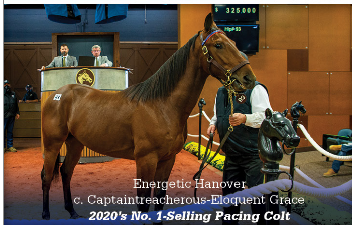
Energetic Hanover c. Captaintreacherous-Eloquent Grace 2020's No. 1-Selling Pacing Colt

LAST CALL! ENTRIES CLOSE MARCH 2 NOV. 8-10 YEARLING SALE