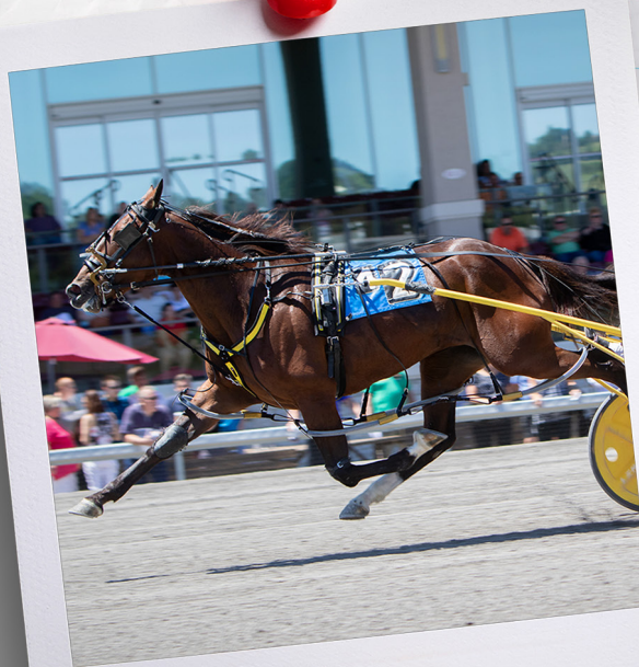
WARRAWEE UBEAUT 2-Year-Old Female Pacer of the Year & world record holder

to my daughter WARRAWEE UBEAUT on your historic achievements of being named 2-Year-Old Female Pacer of the Year and for establishing a new world record of 1:48 3 / 5 in winning the 2018 International Stallion Stakes at Red Mile, eclipsing my world record of 1:49, making you the fastest 2-year-old in harness racing history.