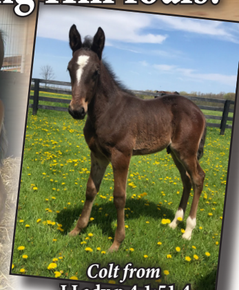
Colt from I Lady p,4,1:51.4 ($178,374)