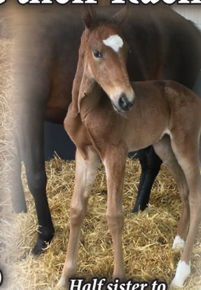
Half sister to Major Hill p,1:49.2 ($244,646)