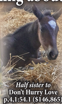
Half sister to Don't Hurry Love p,4,1:54.1 ($146,865)