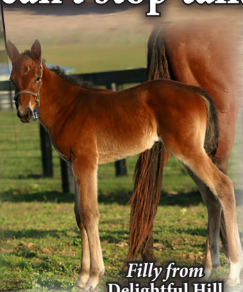
Filly from Delightful Hill p,4,1:50.4 ($253,957)