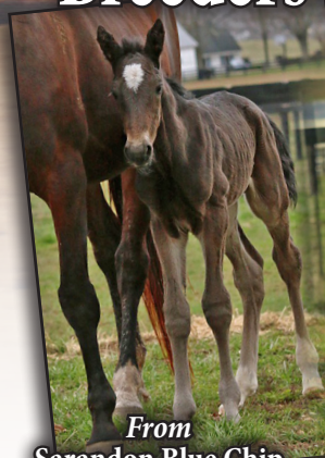
From Sarandon Blue Chip p,3,1:50.1 ($211,112)

Breeders can't stop talking about their Racing Hill foals!