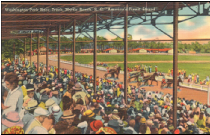
Washington Park

attempts to try several forms of gambling, Washington Park Race Track had a run of merely nine years until the South Carolina Supreme Court slammed the wagering door.”