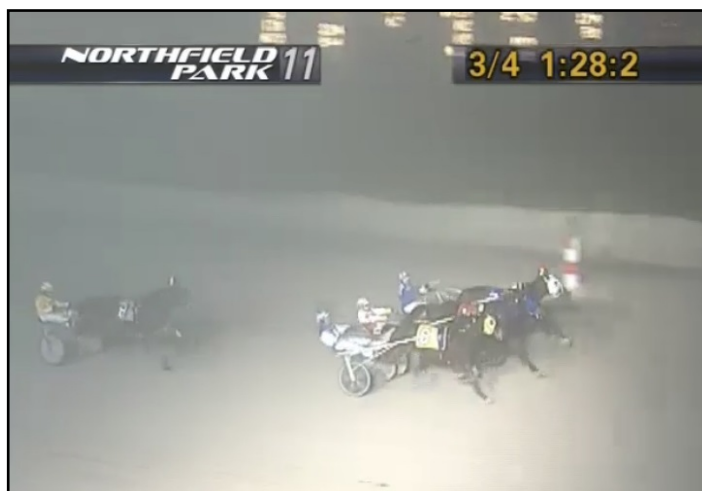
You make the call. The finish line angle at Northfield Park in the 11th race on Feb. 6.

"There are many of us have done this for many years. I even called charts. There wasn't one guy in the whole place that thought the 1 won," @Rojthedo1 tweeted. No one is suggesting the wrong number was posted, but the real